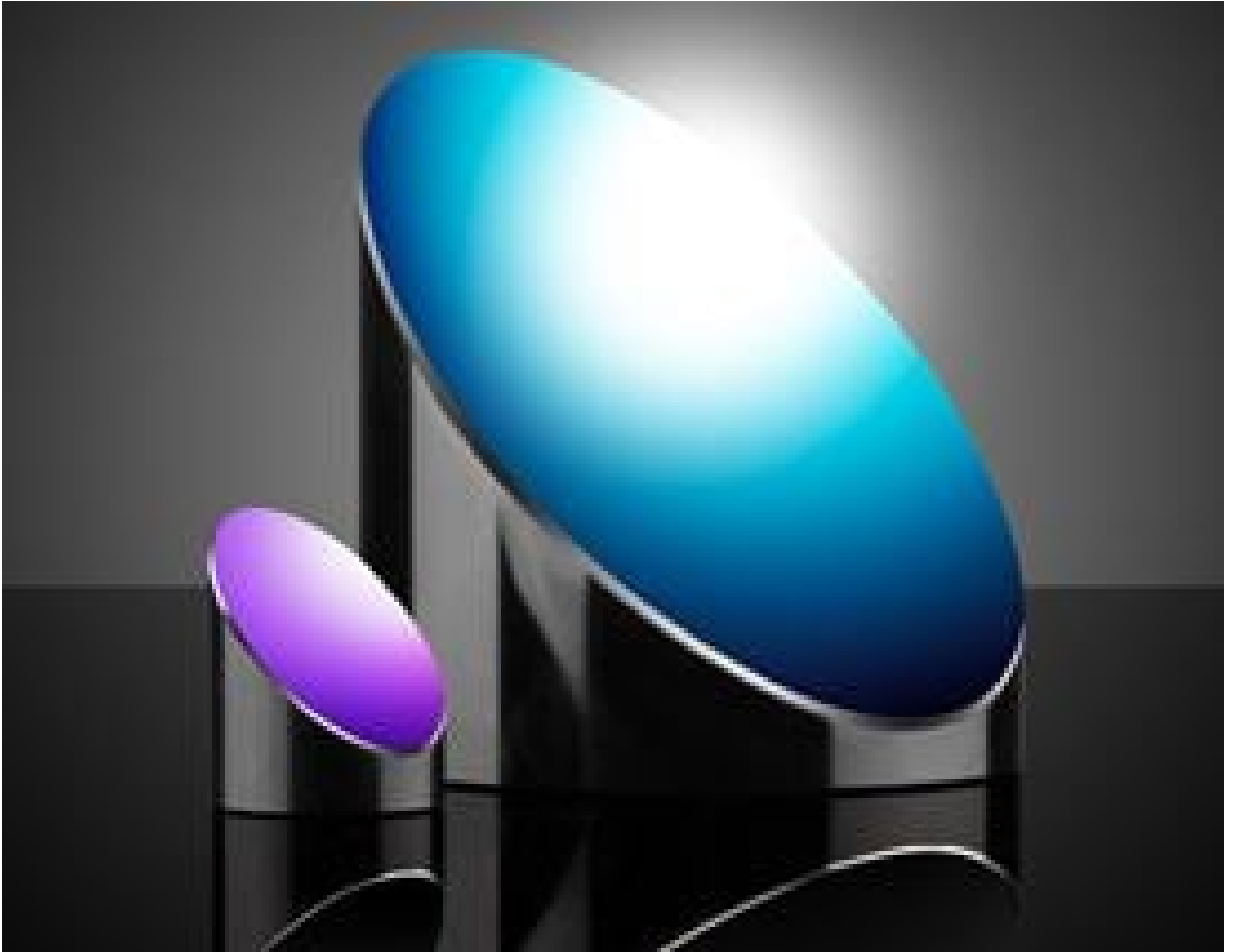
TECHSPEC® Laser Line Coated Off-Axis Parabolic (OAP) Mirrors