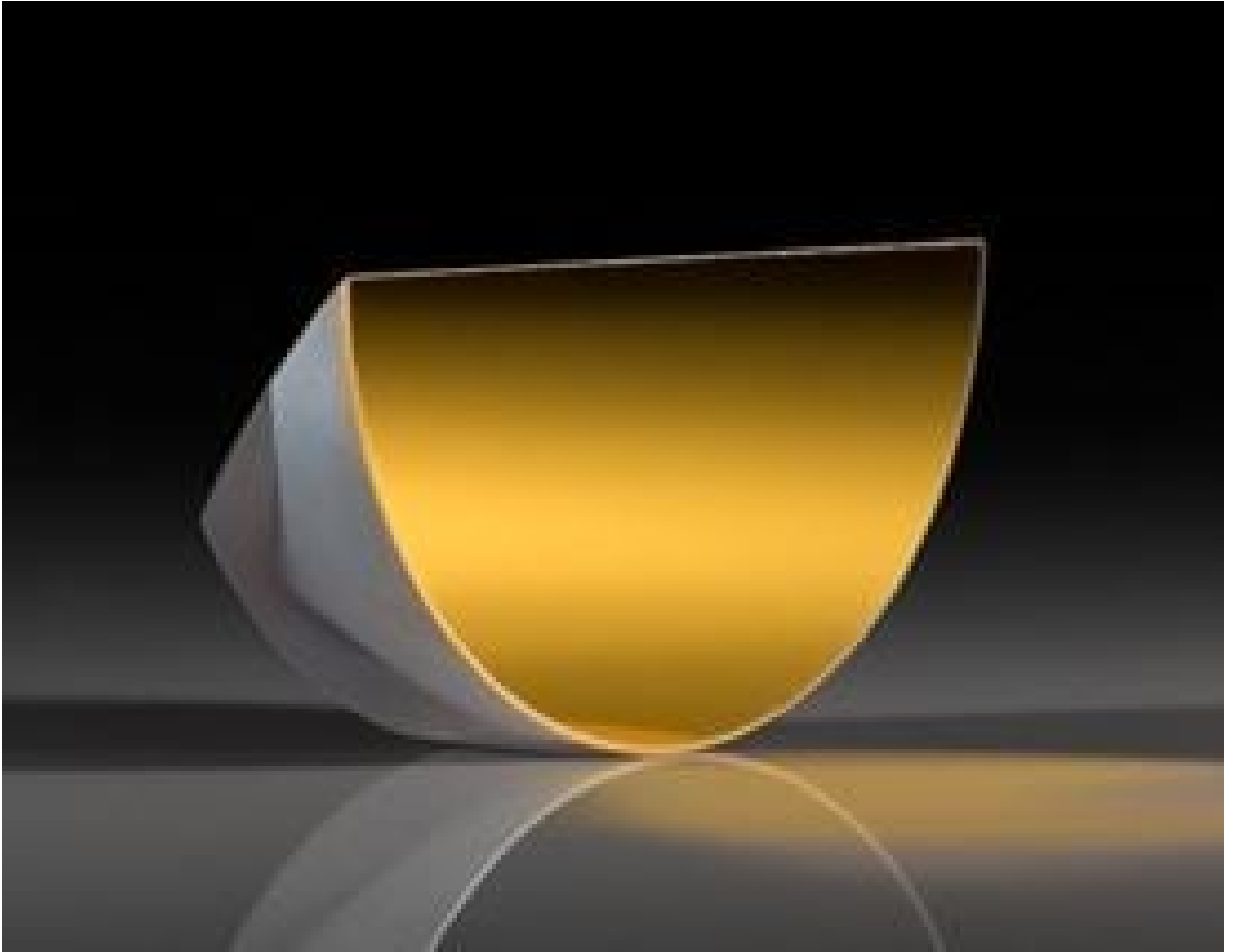
25.4mm Enhanced Protected Gold \lambda/10 D-Shaped Pickoff Mirror, #36-136