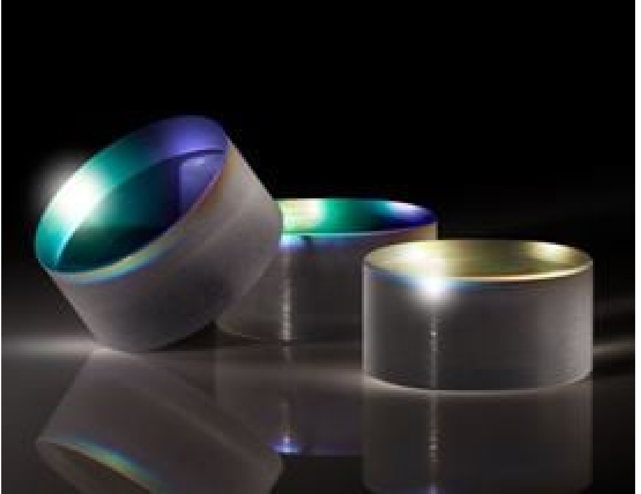
UltraFast Innovations (UFI) High-Power Low-Loss Laser Mirrors