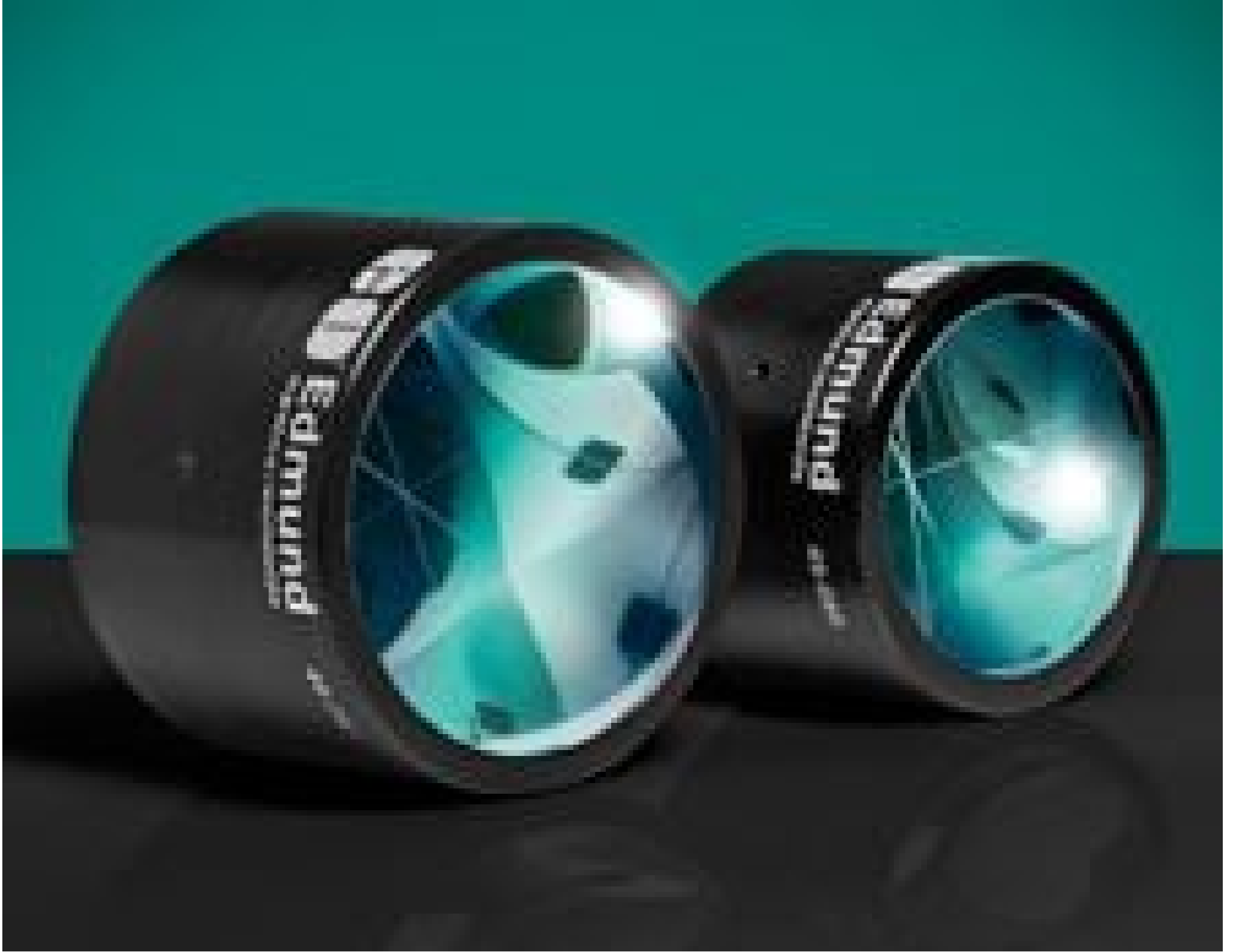
Mounted N-BK7 Corner Cube Retroreflectors