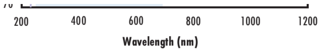
Fused Silica with VIS-EXT Coating Typical Transmission