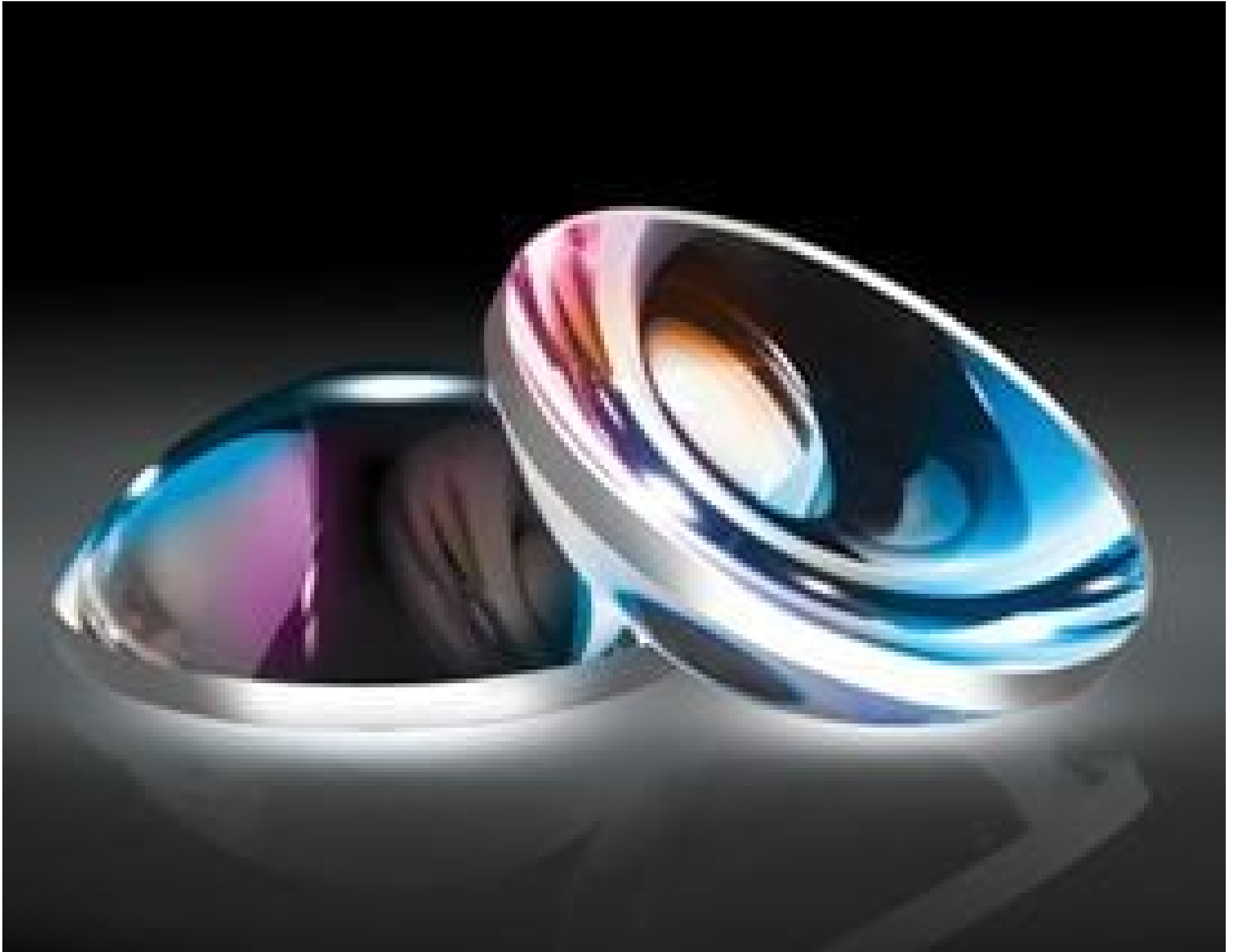
Calibration Grade Aspheric Lenses