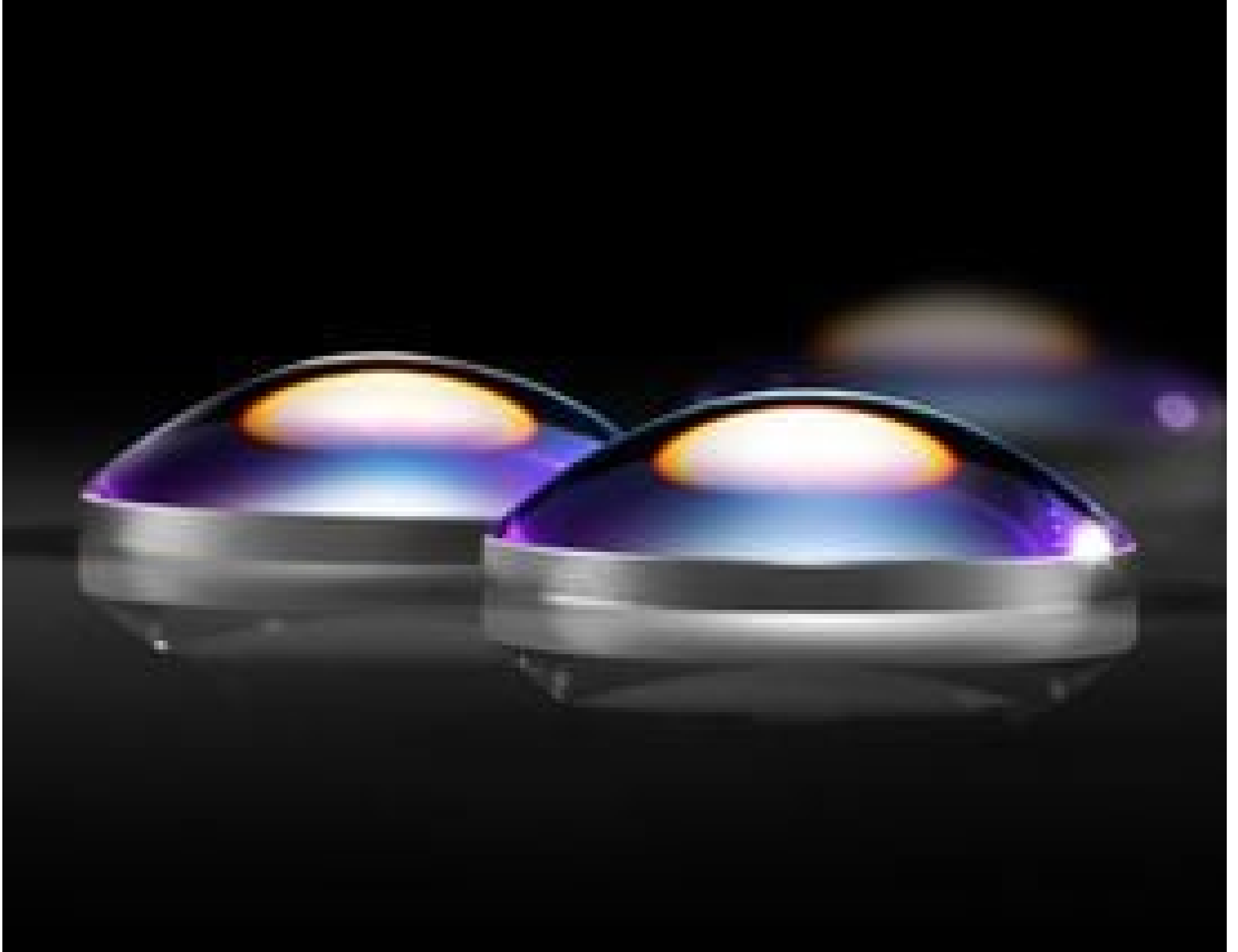
TECHSPEC® Precision Molded Aspheric Lenses