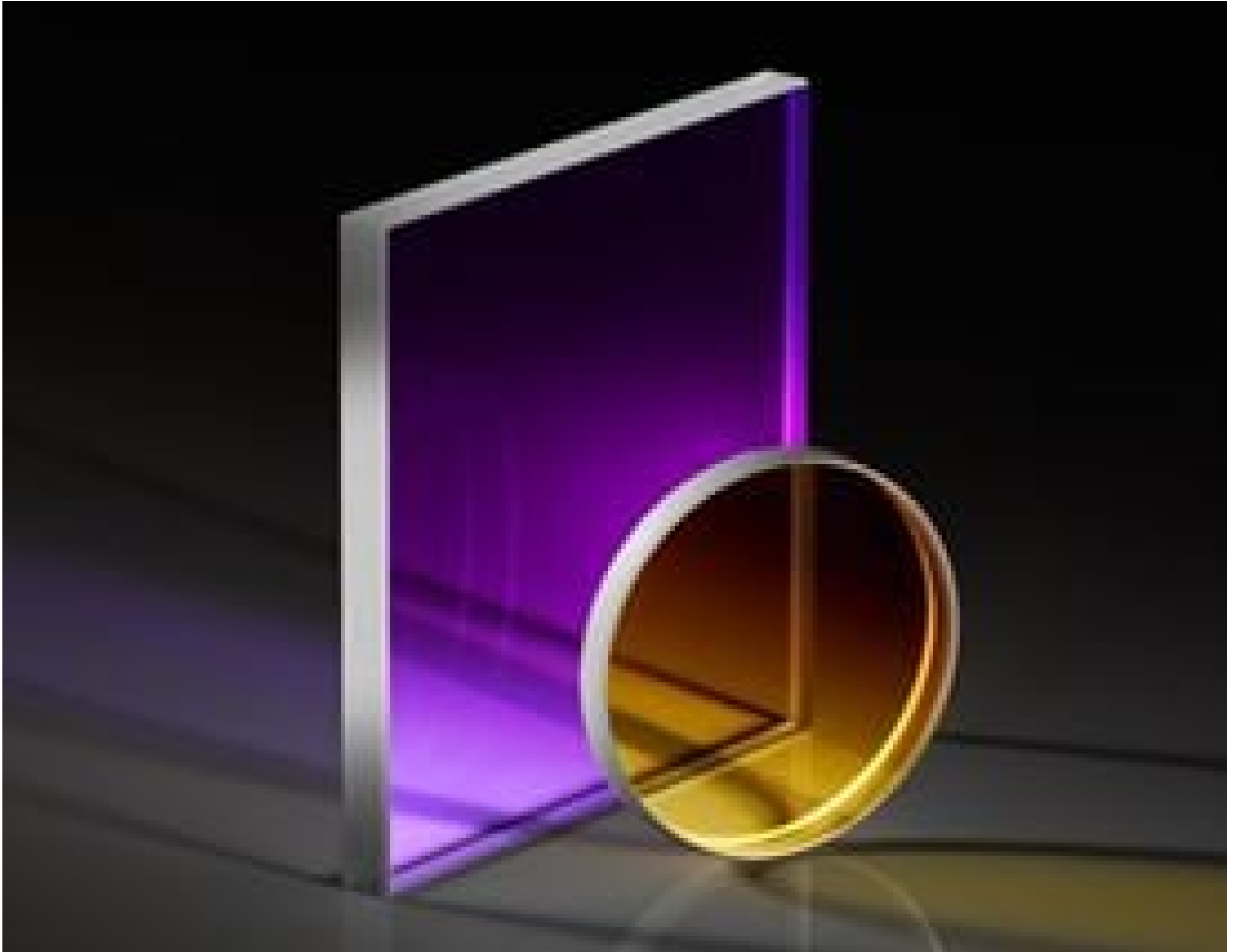
TECHSPEC® 1λ UV Fused Silica Windows