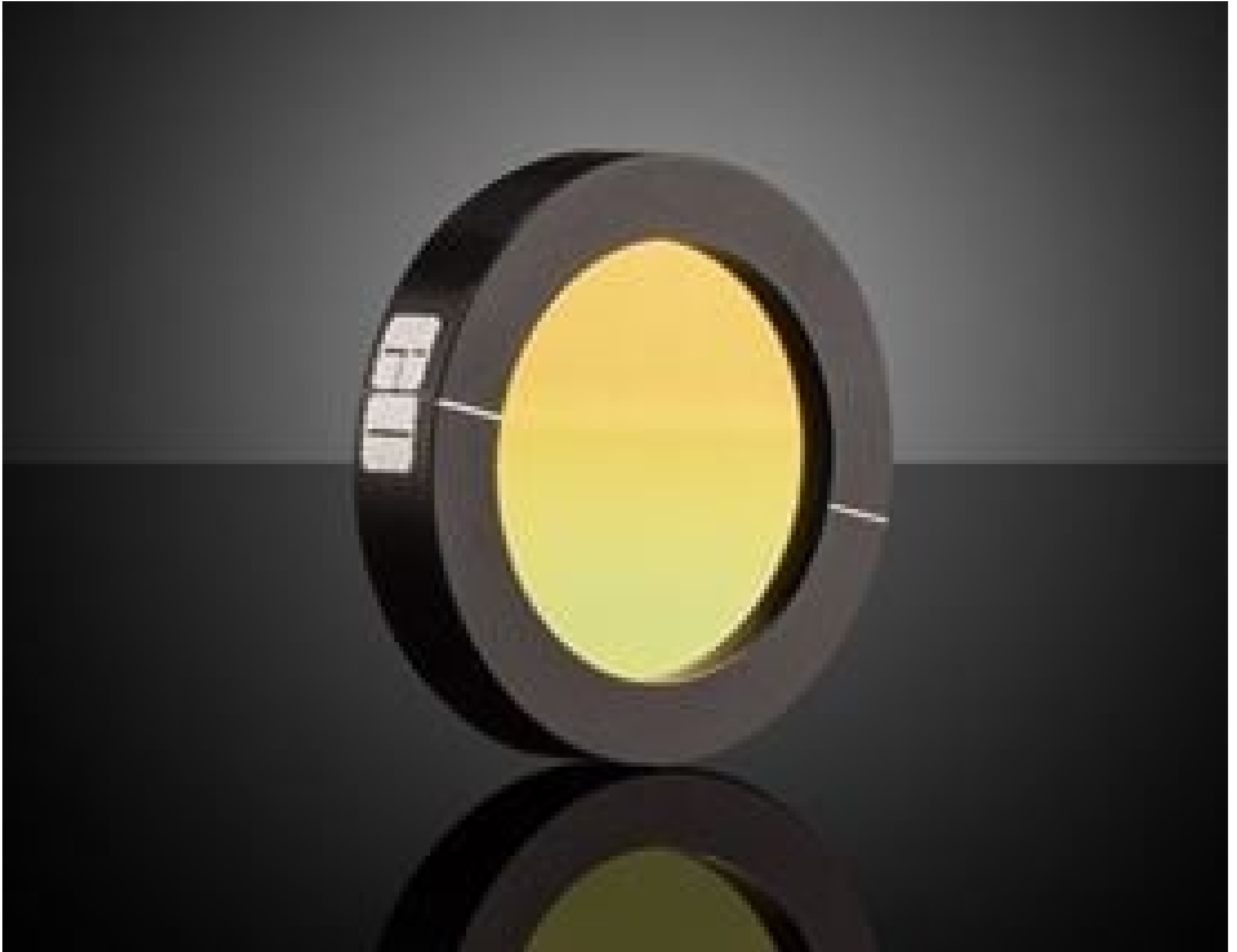
25mm Dia. BaF 2 , IR Holographic Wire Grid Polarizer, #62-770