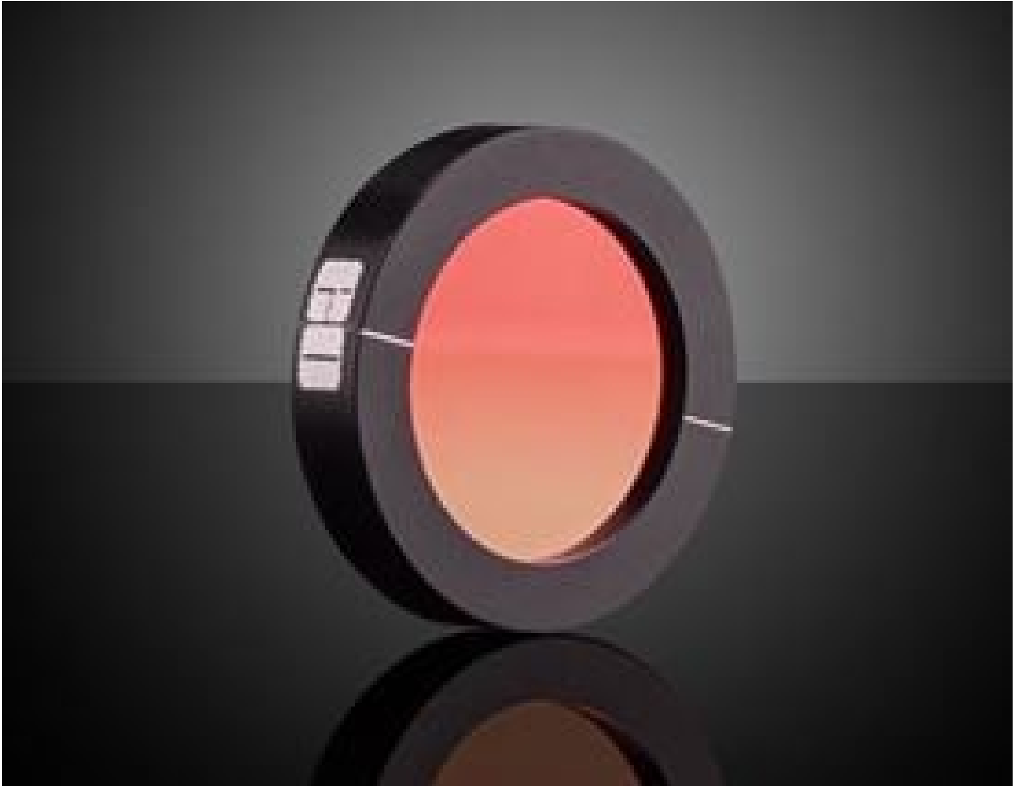
25mm Dia. Ge, IR Holographic Wire Grid Polarizer, #62-776