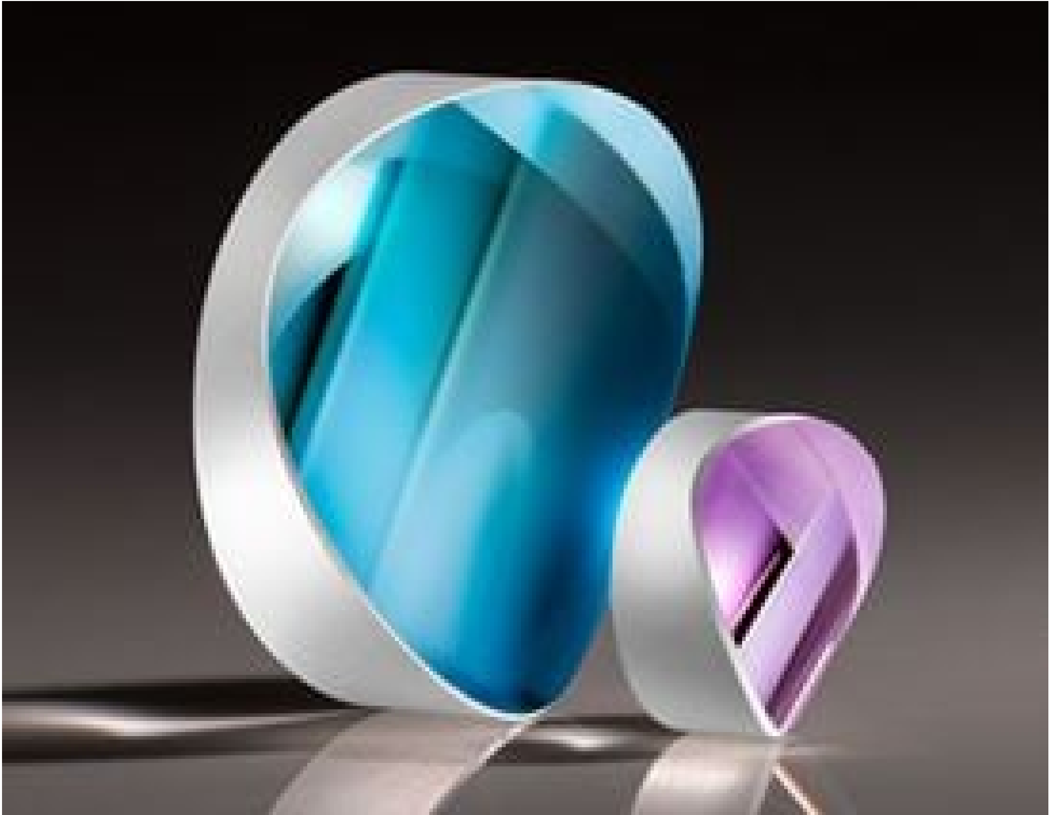
TECHSPEC Acylinder Lenses