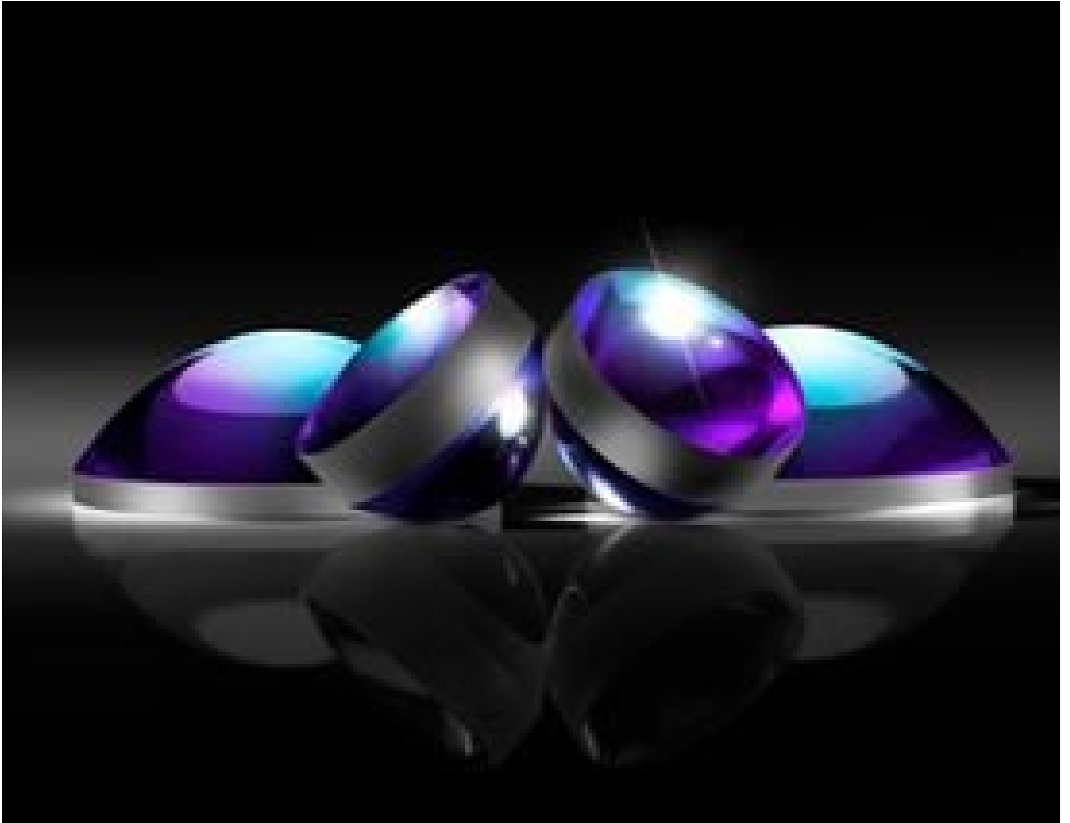
TECHSPEC® Calcium Fluoride (CaF 2 ) Aspheric Lenses