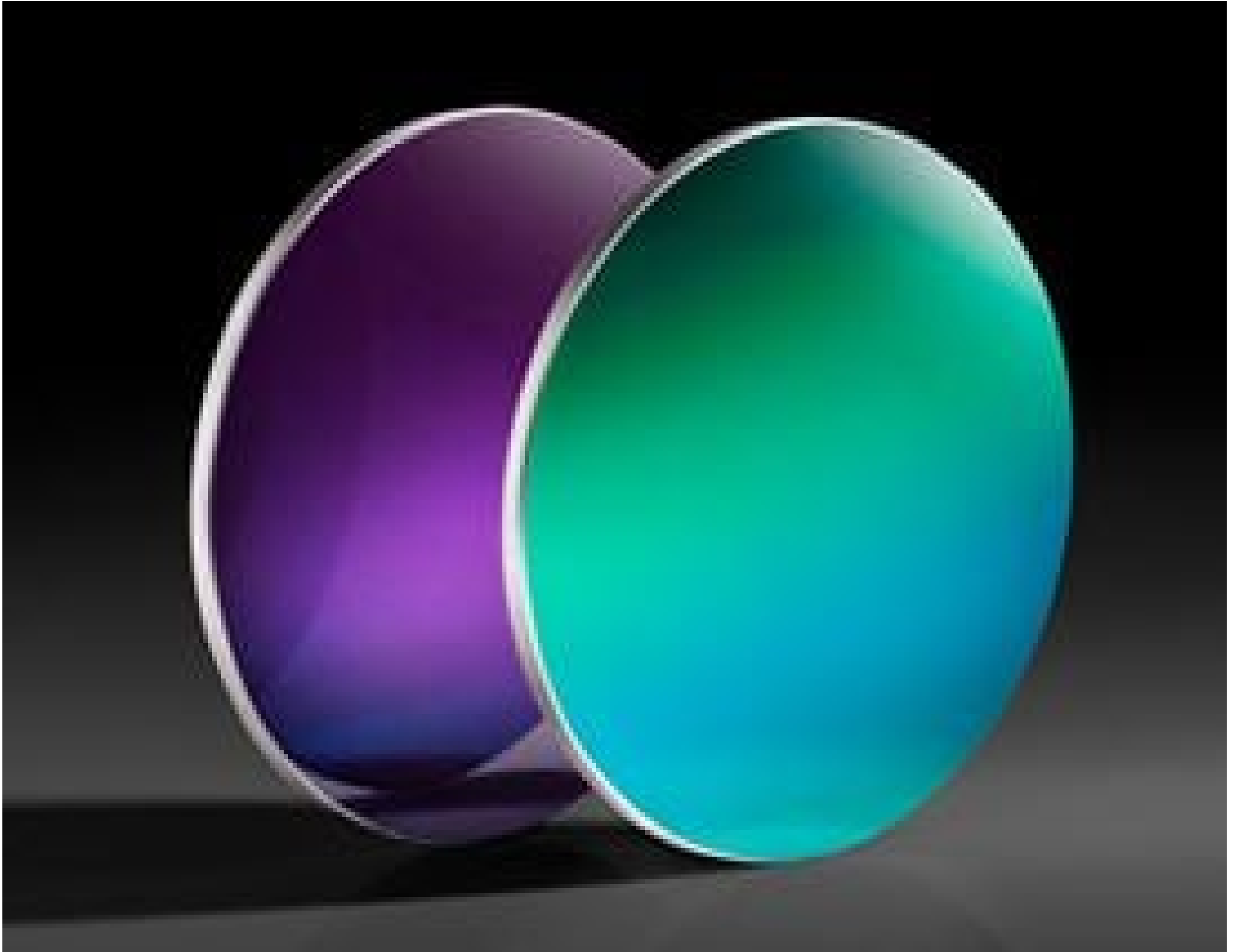
TECHSPEC Silicon (Si) Windows