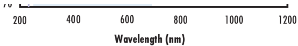
Fused Silica with VIS-EXT Coating Typical Transmission