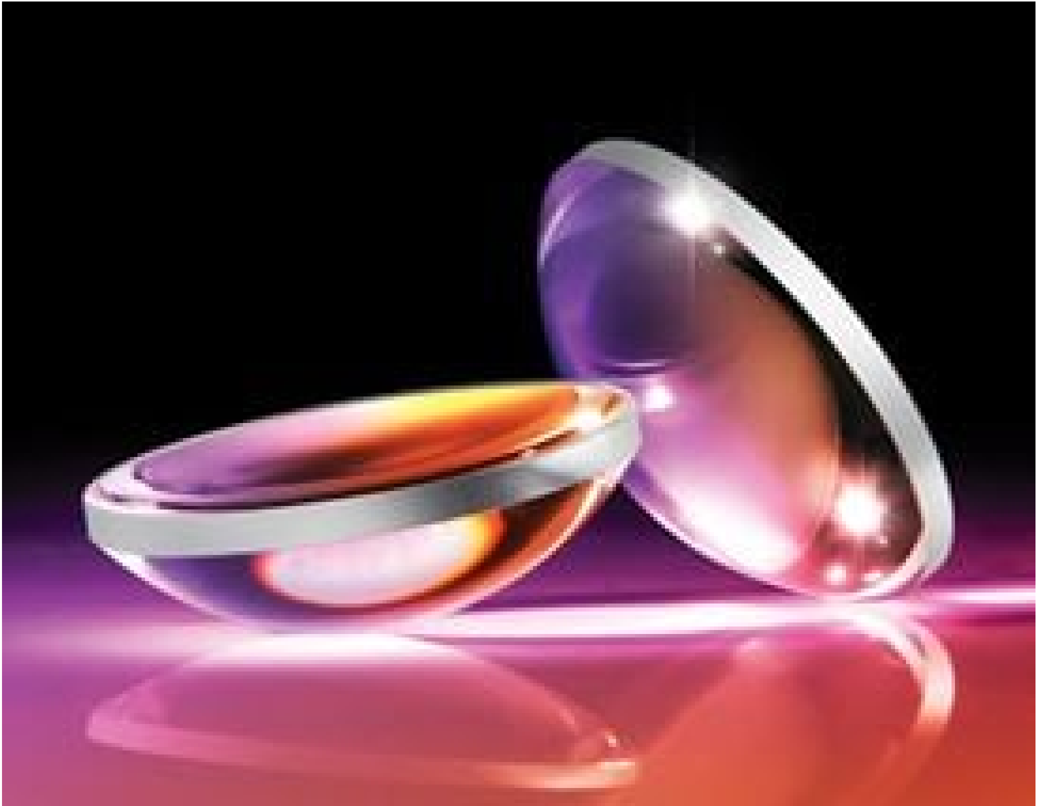
Hyperbolic Aspheric Lenses