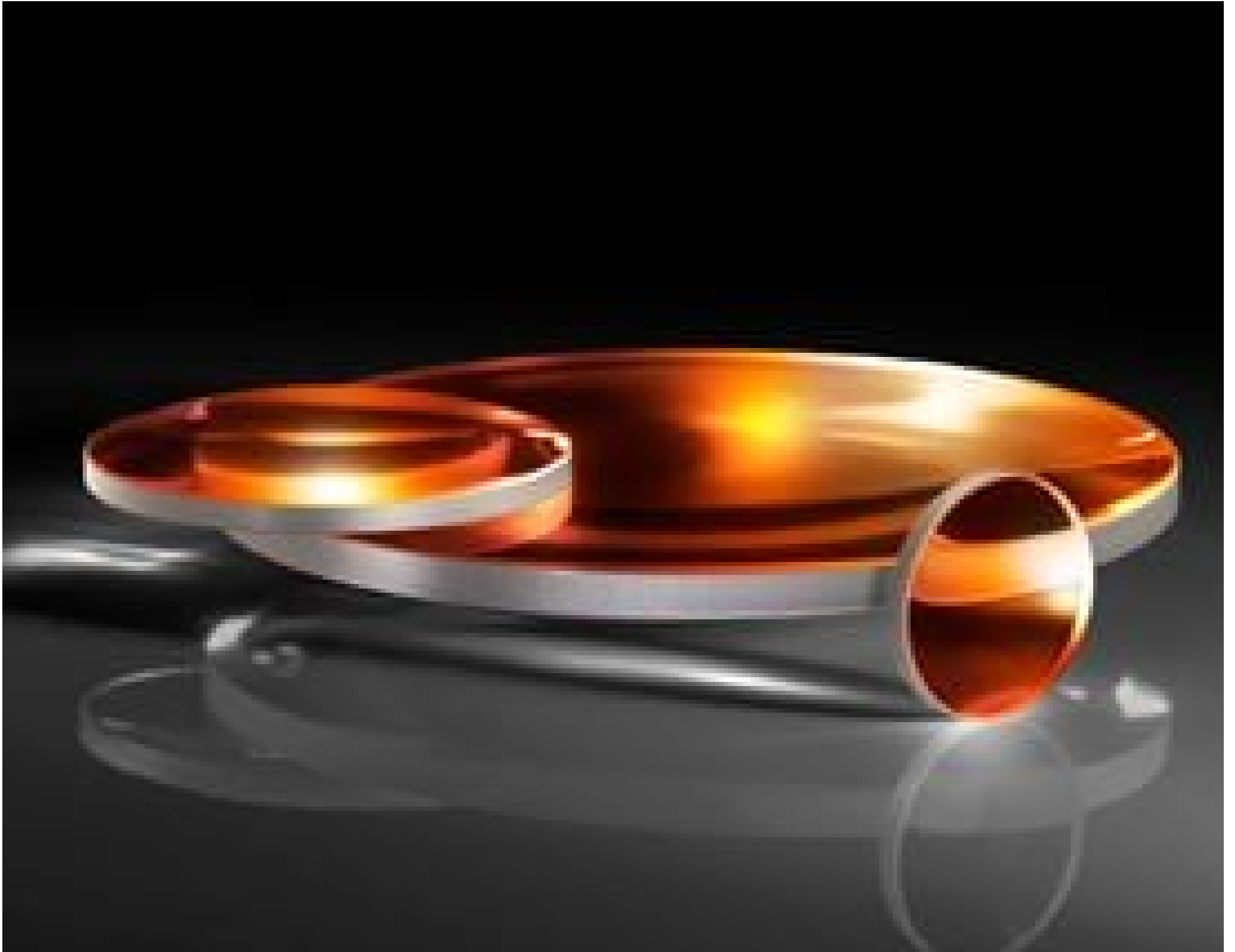
TECHSPEC Calcium Fluoride Plano-Convex (PCX) Lenses