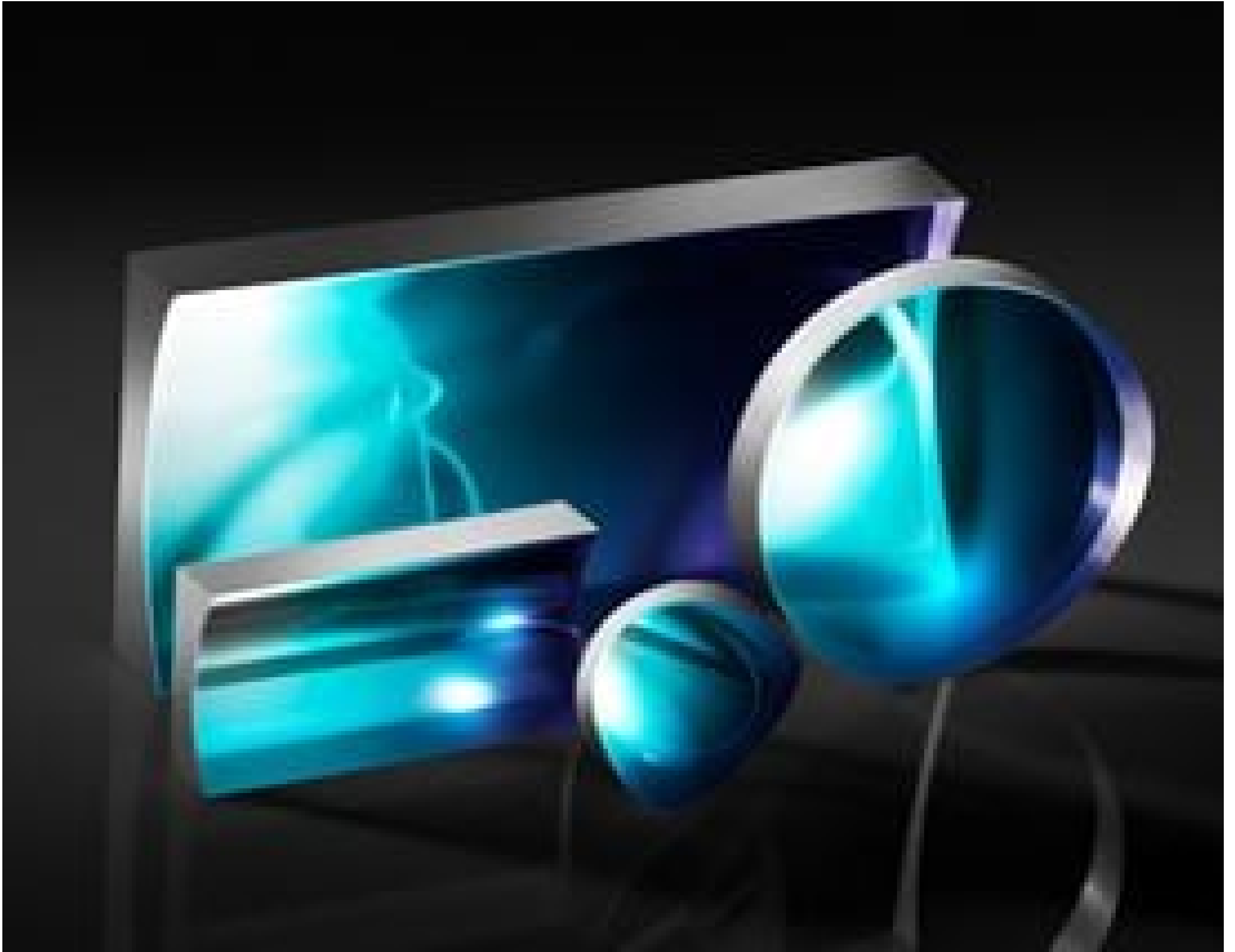
TECHSPEC® Illumination Grade PCV Cylinder Lenses