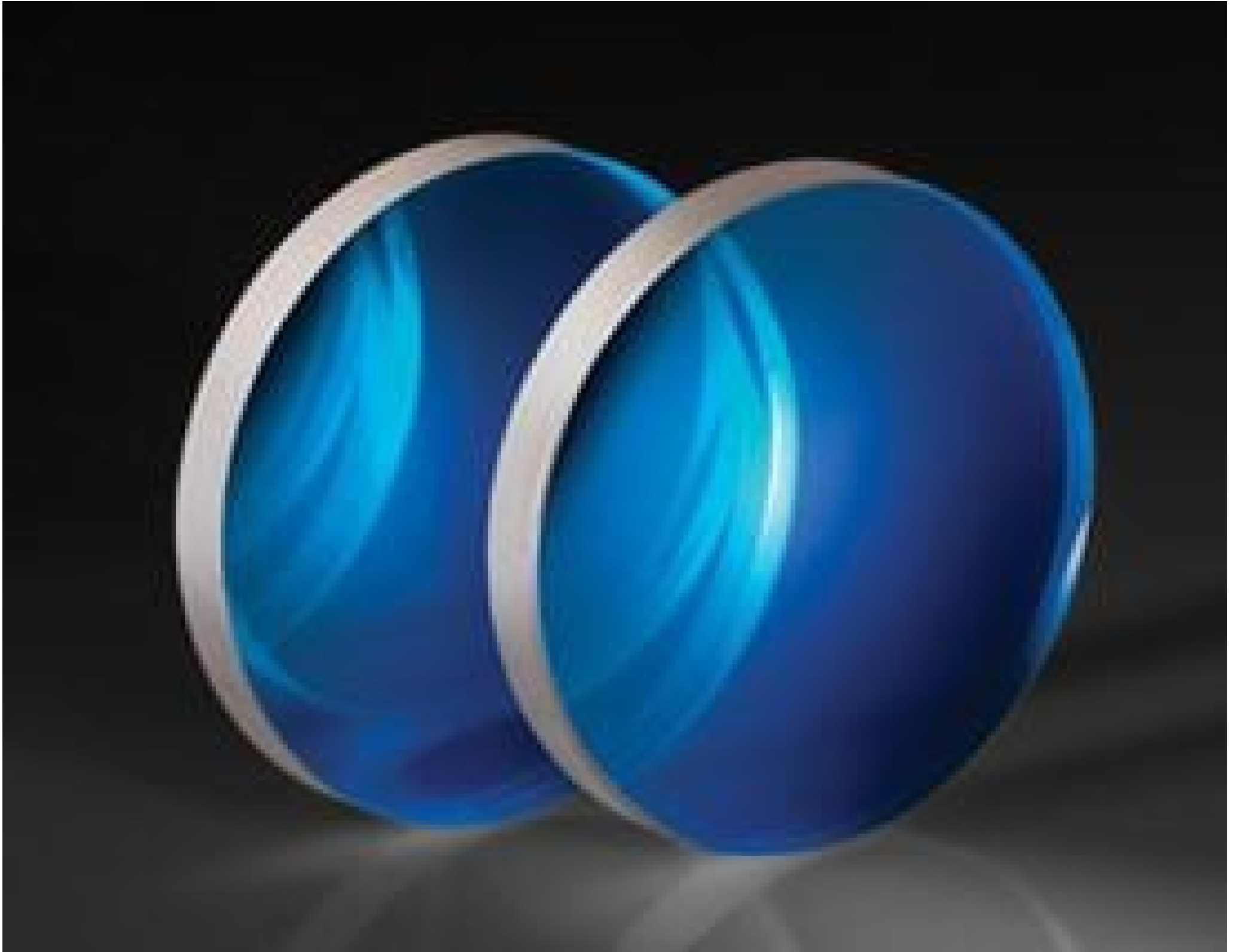
TECHSPEC® M10 Plate Beamsplitters