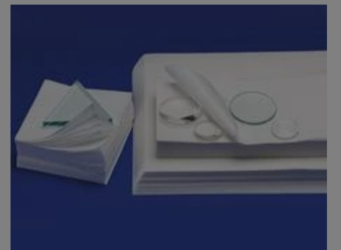
#53-984 - 4" x 4" Cloth Cleaning Wipes €36,25