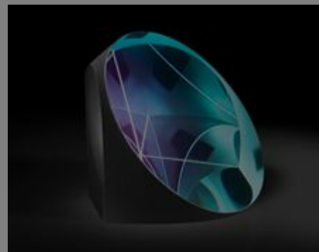
#48-606 - 12.7mm Silver and VIS 0° Coated, Corner Cube Prism €289,00