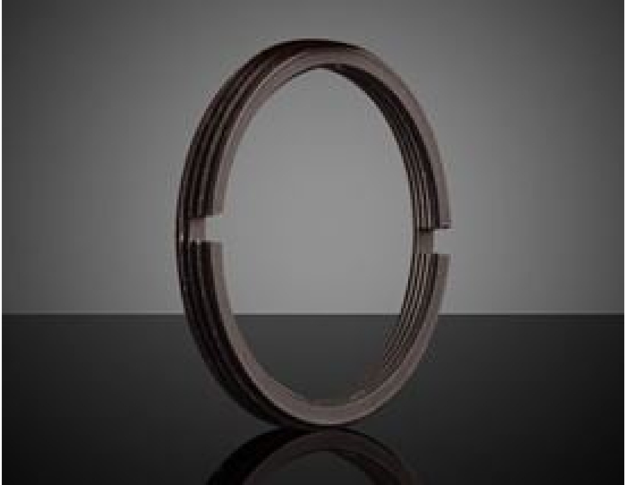
25mm Filter Retainer for TS-160, #88-932

See More by Infinity Photo-Optical Company