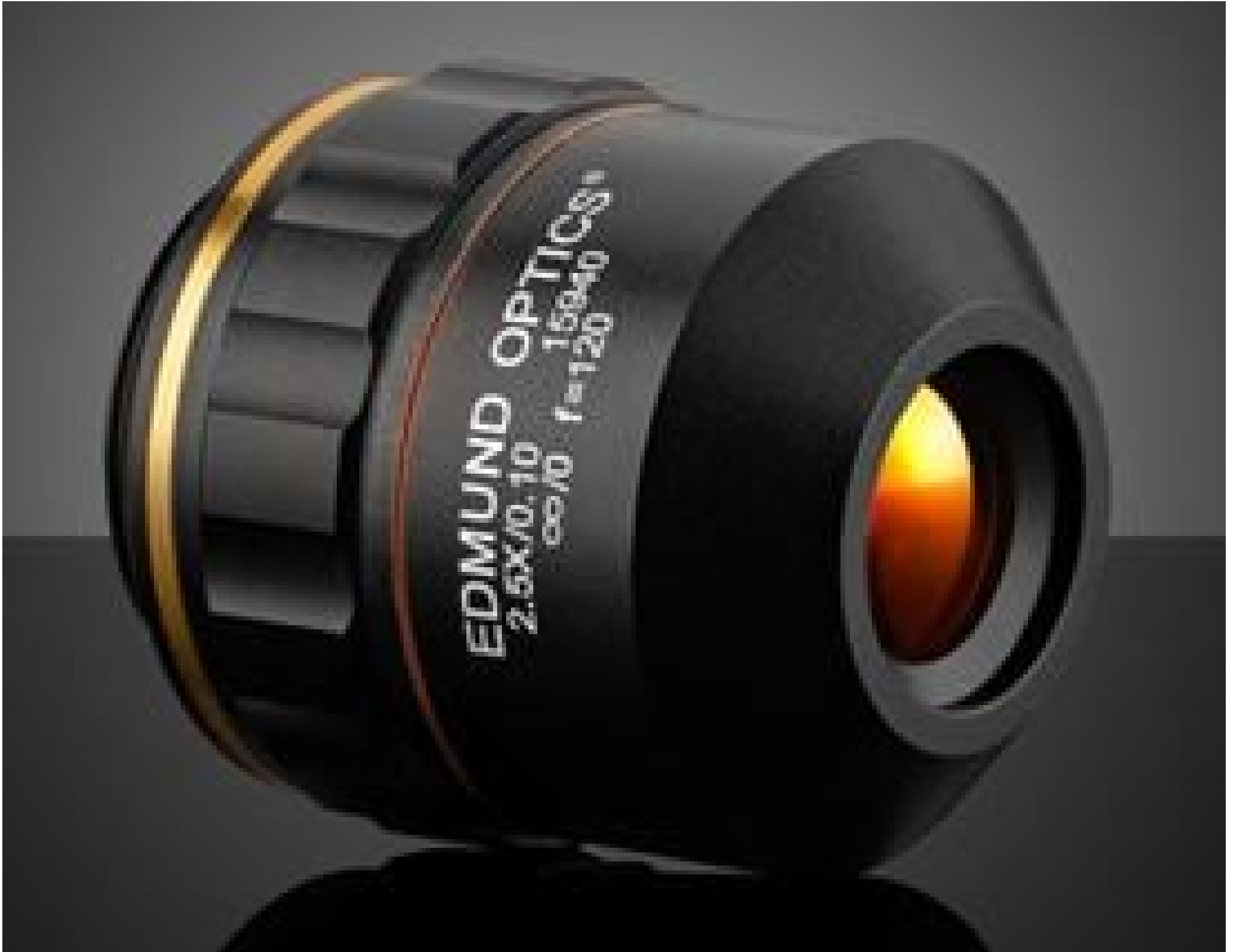
2.5X 120i Plan APO Infinity Corrected Objectives