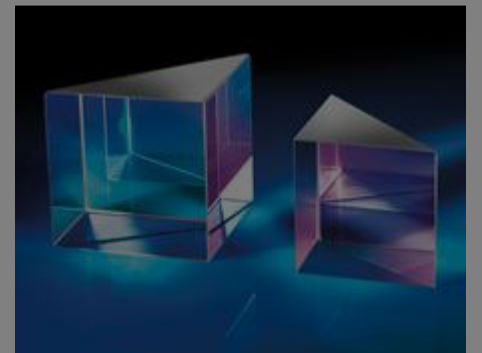
#32-542 - 7mm, Aluminum, High Tolerance N-BK7 Right Angle Prism €111,00