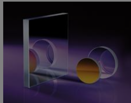
#32-514 - 51mm Dia. Enhanced Aluminum, \lambda/4 Mirror €134,00