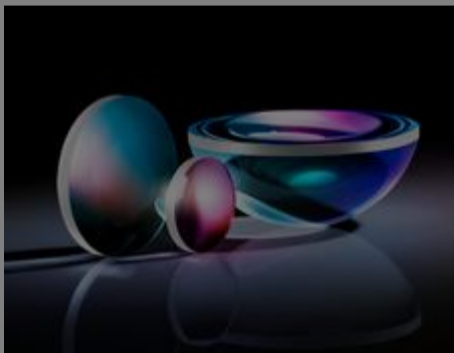
#32-471 - 6.0mm Dia. x 12.0mm FL Uncoated, Plano-Convex Lens €29,50