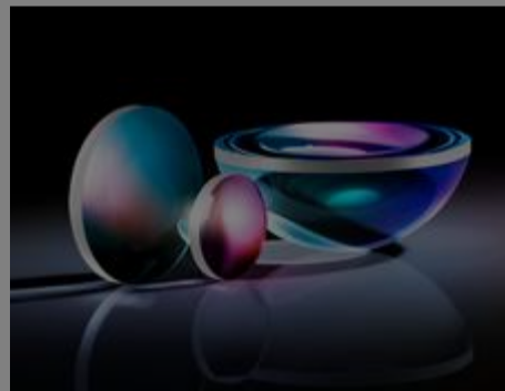
#32-473 - 6.0mm Dia. x 18.0mm FL Uncoated, Plano-Convex Lens €29,50