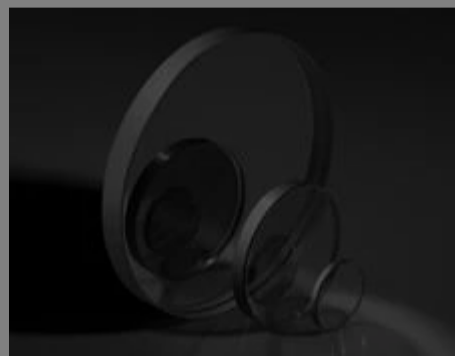
#47-207 - 1.0 OD 25mm Diameter UV-VIS ND Filter €131,00