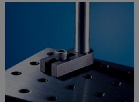
#53-355 - English Post Pivot Base €23,00