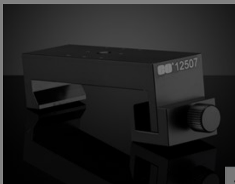
30mm Precision Stage, Metric Dovetail Carrier

Please select your shipping country to view the most accurate inventory information, and to determine the correct Edmund Optics sales office for your order.