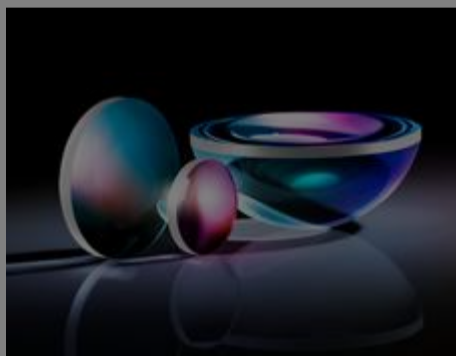
#32-974 - 50.0mm Dia. x 150.0mm FL, Uncoated, Plano-Convex Lens €49,50