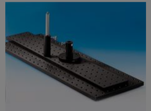
English and Metric Breadboards