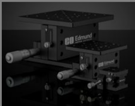
Vertical Translation Stages