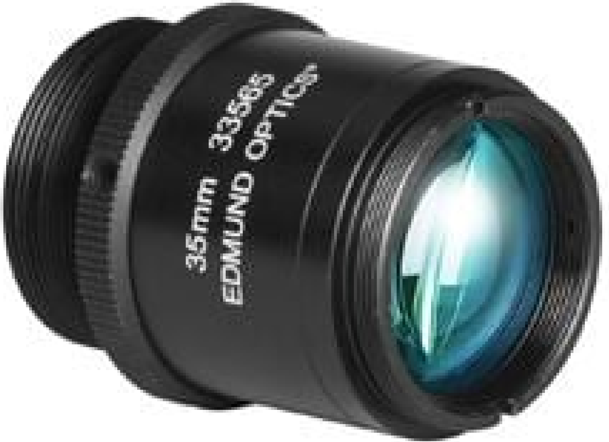
35mm Cx Series Fixed Focal Length Lens, #33-565