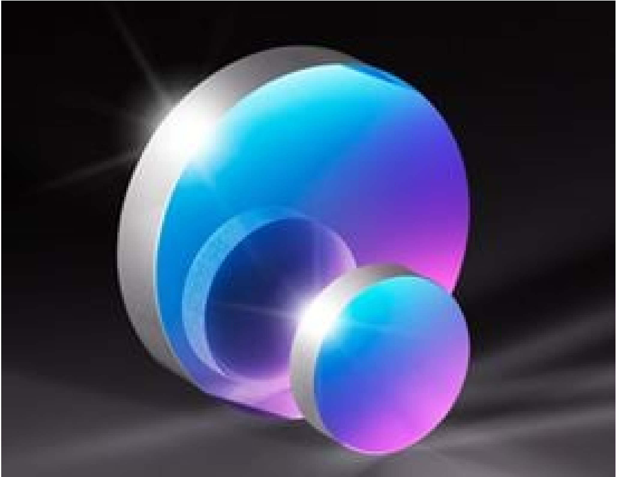
Precision Ultraviolet Mirrors