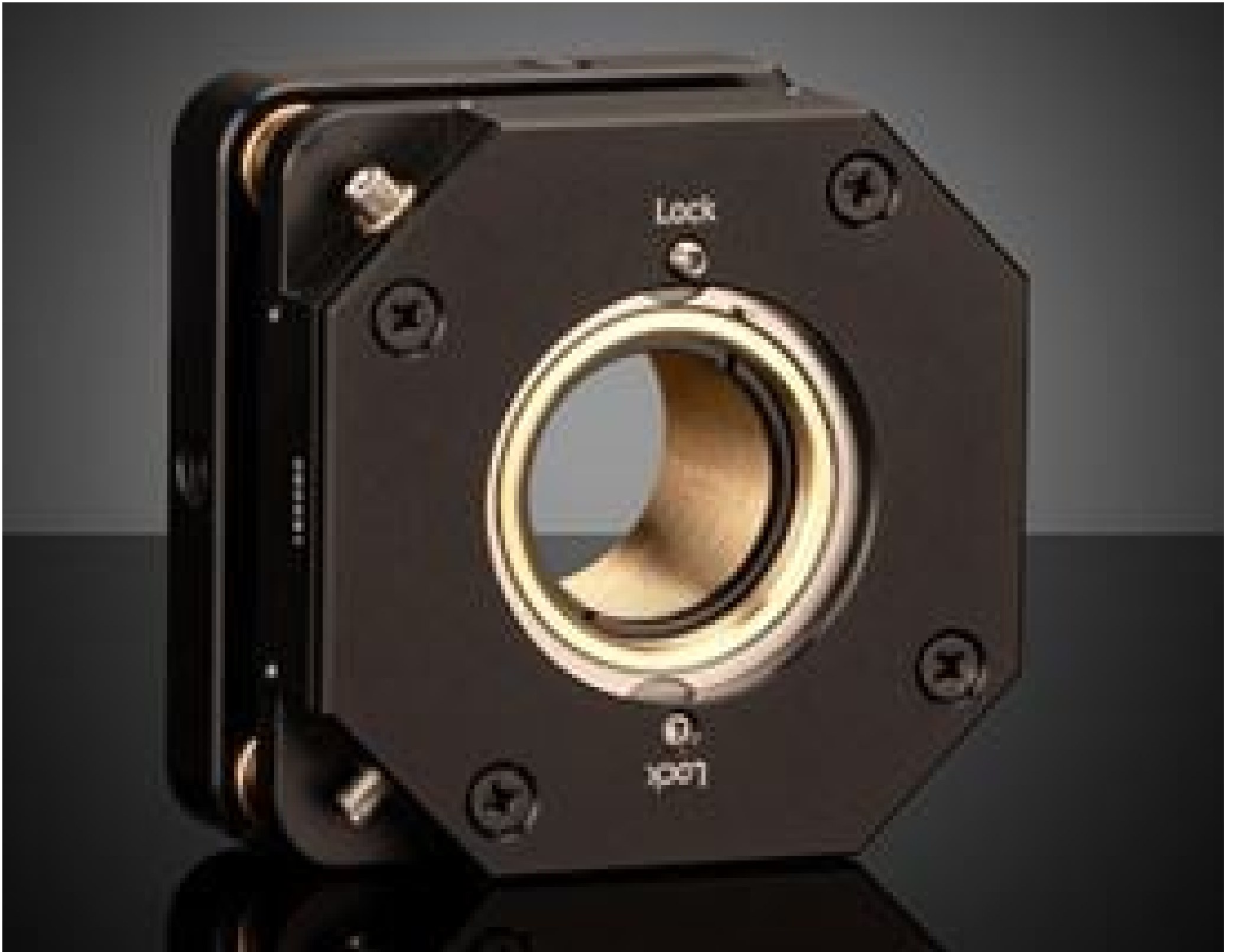
4-Axis Flat Top Beam Shaper Mount M27