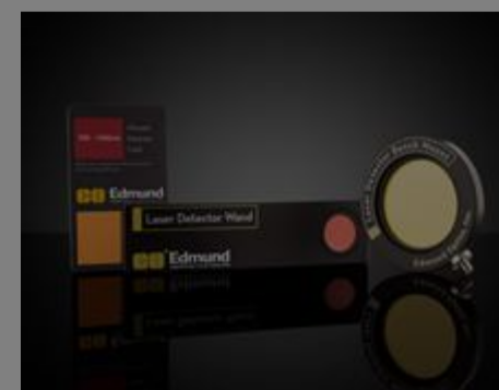
Laser Detection Products