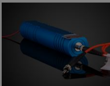
Fiber-Coupled Laser Modules