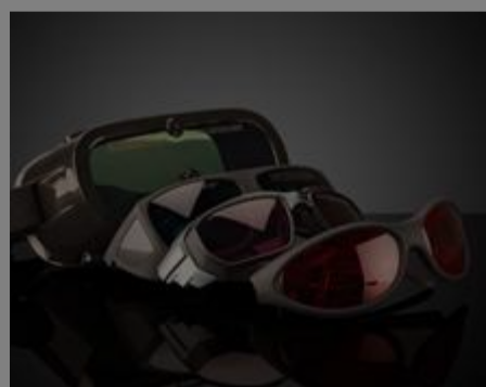
Laser Safety Glasses and Goggles