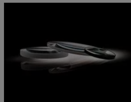
#67-595 - 4.5mm Dia. x 9mm FL, NIR II Coated, Double-Convex Lens €71,50