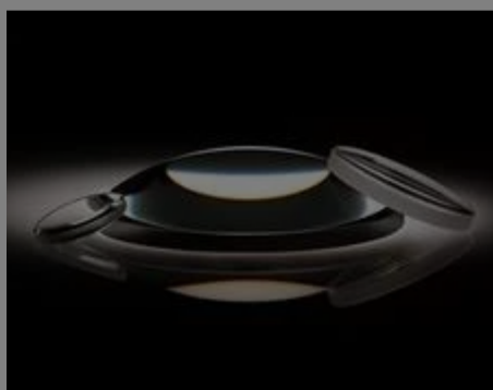
#47-853 - 4.0mm Dia. x 10.0mm FL, VIS-NIR Coated, Plano-Convex Lens €71,50