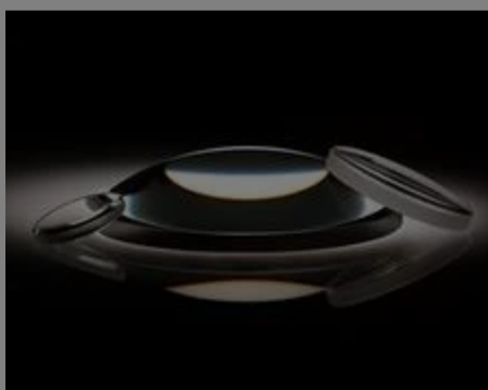
#48-661 - 5.0mm Dia. x 7.5mm FL, VIS-NIR Coated, Plano-Convex Lens €55,50