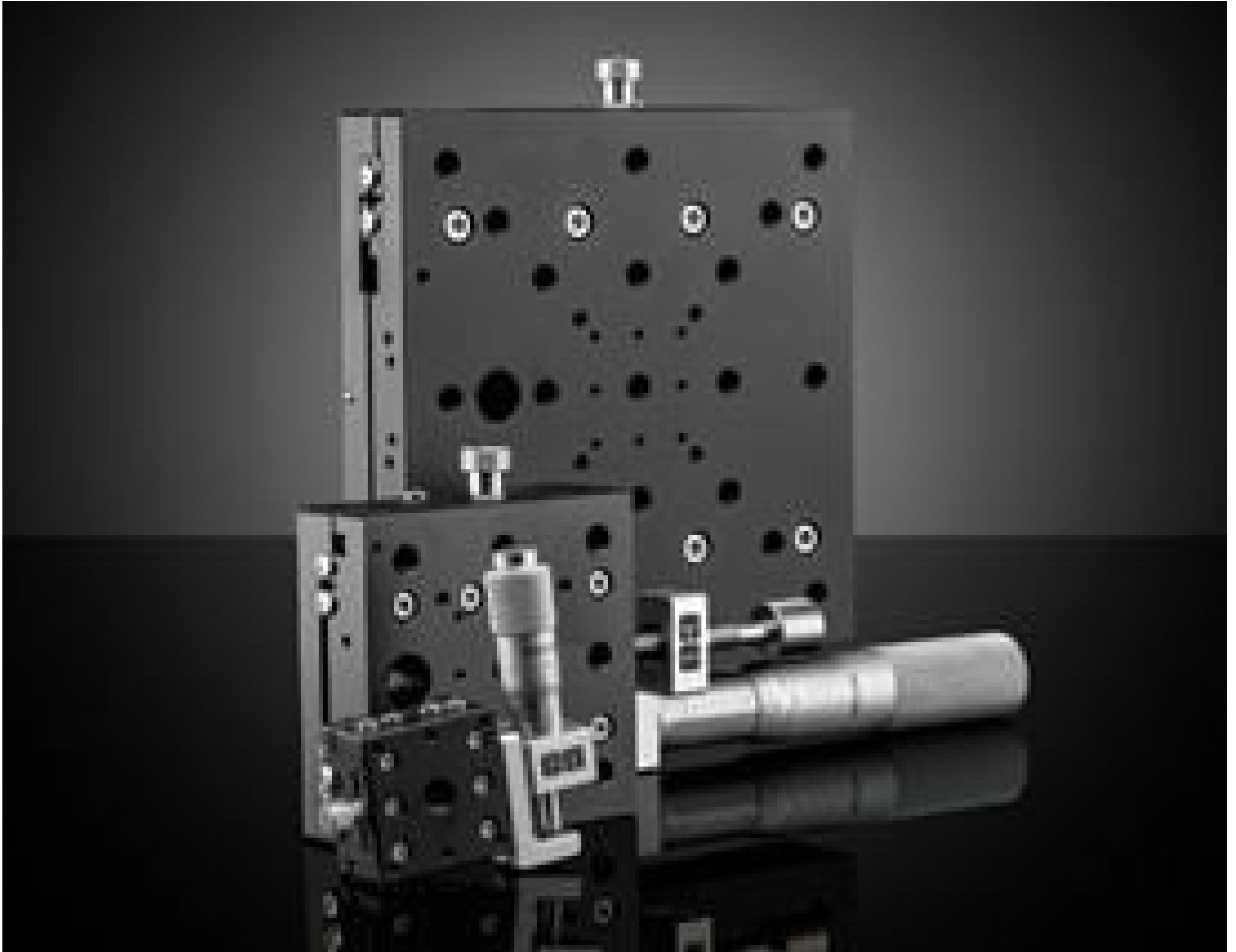
TECHSPEC® Crossed-Roller Bearing Linear Translation Stages (Standard-Top Model)