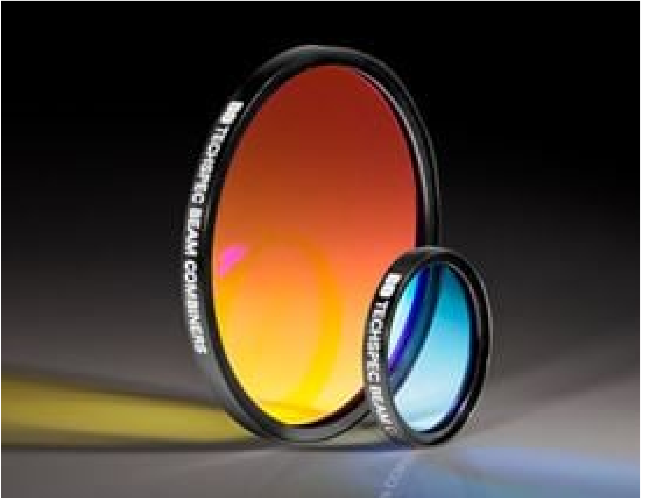
TECHSPEC® Dichroic Laser Beam Combiners