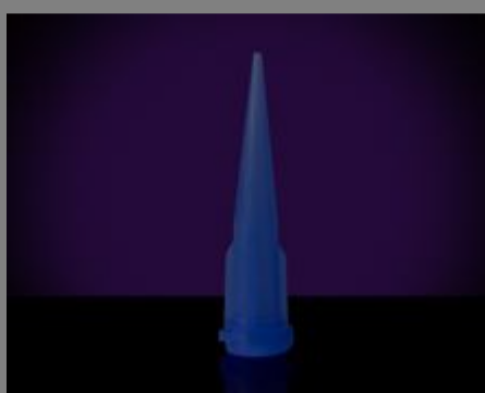
#55-064 - 22 Gauge (50 Count), UV Blocking Tapered Tips