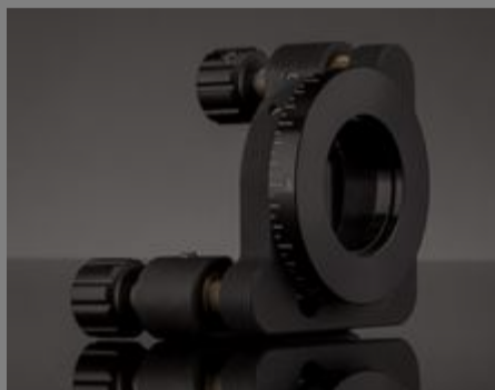
Rotation Kinematic Mounts