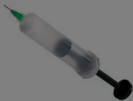
#55-044 - HandPlunger (3cc Barrel), Dispenser Units