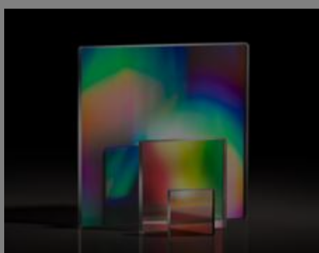
#49-578 - 1200 Grooves, 12.7mm Sq, 36.9° Groove Angle Grating