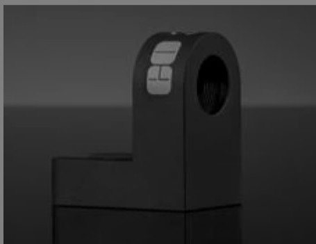
Compact Direct Mounts