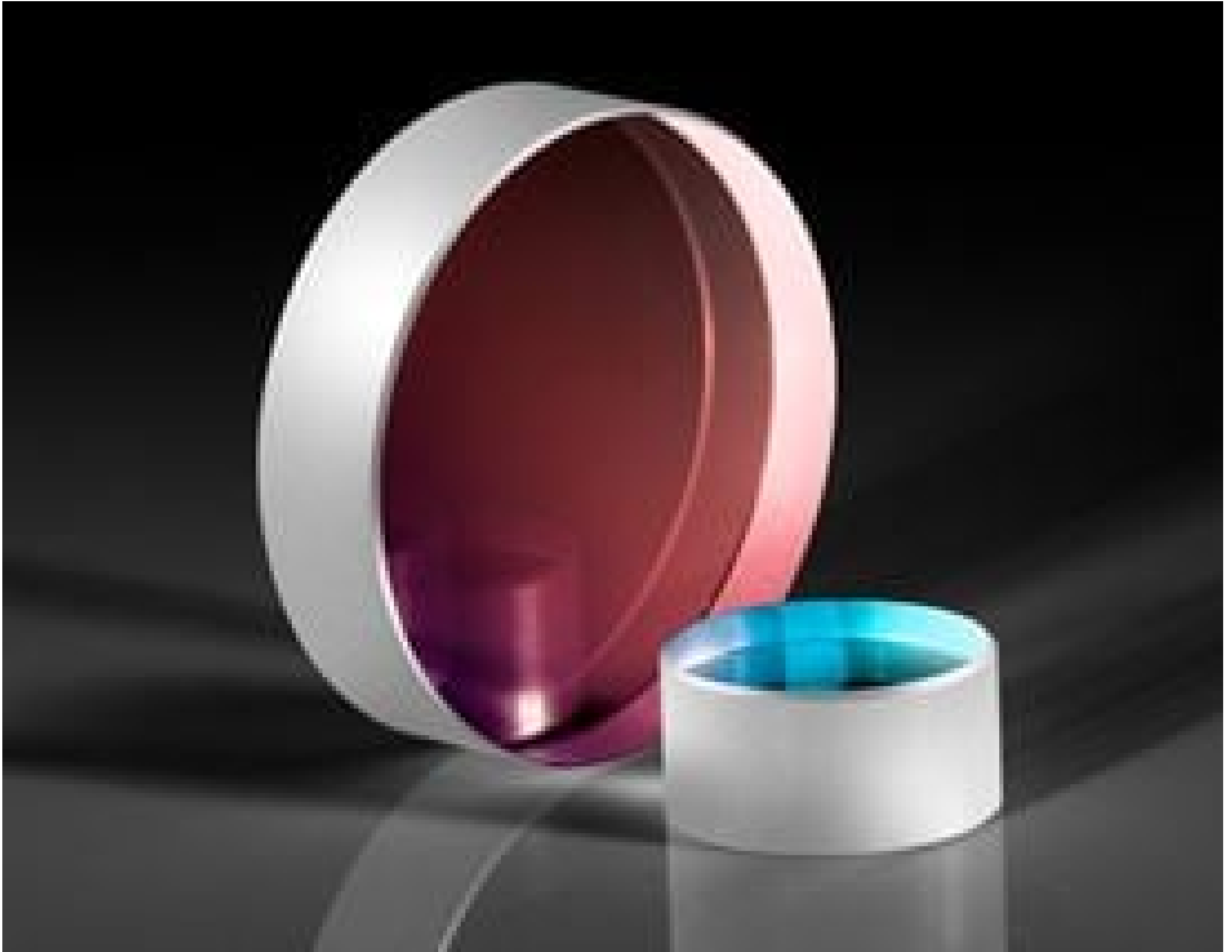
N/10 Ultra-Low Reflectivity Windows