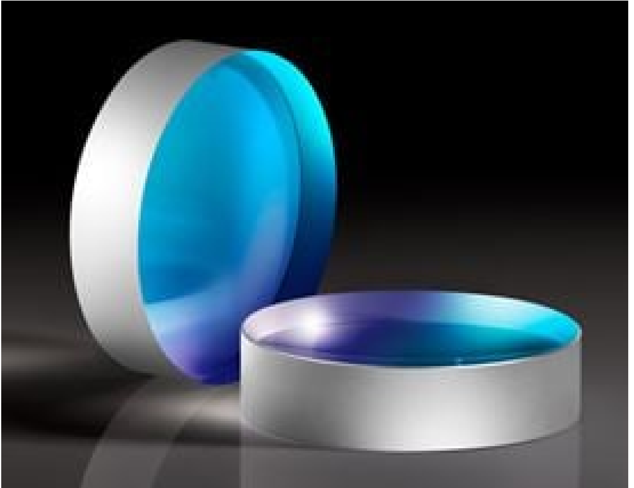
Laser Line Concave Mirrors