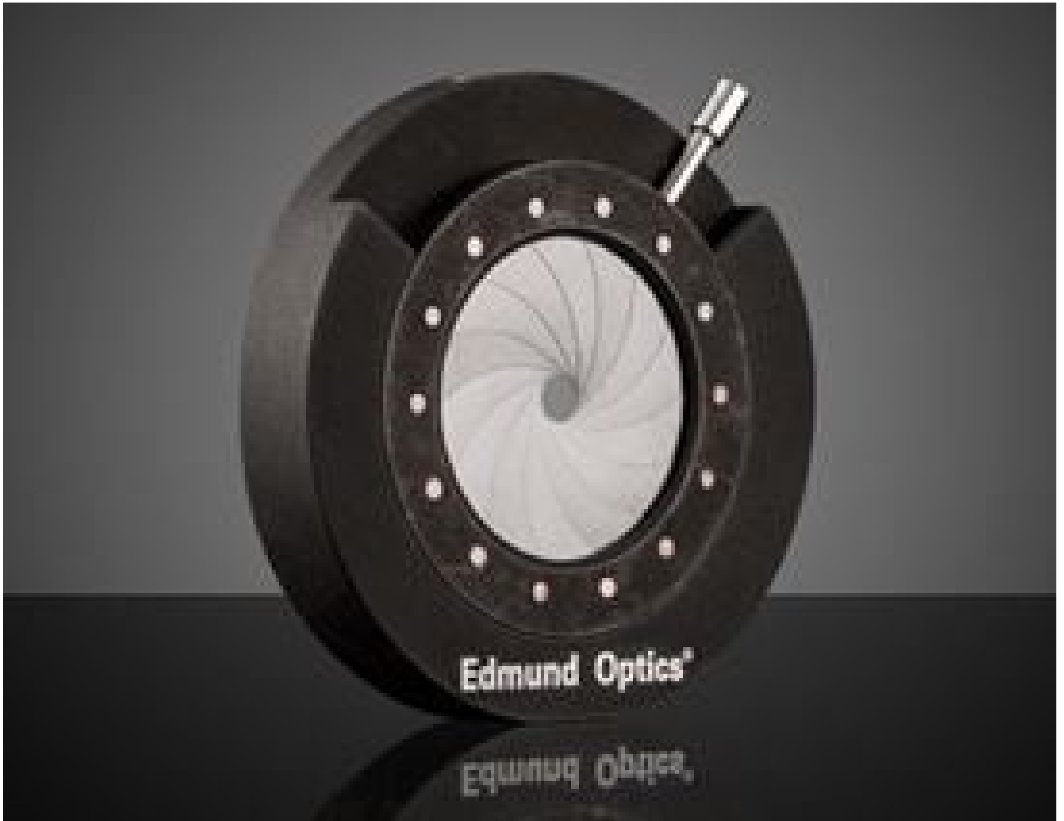
50.8mm Outer Diameter, Mounted Iris Diaphragm, #53-915