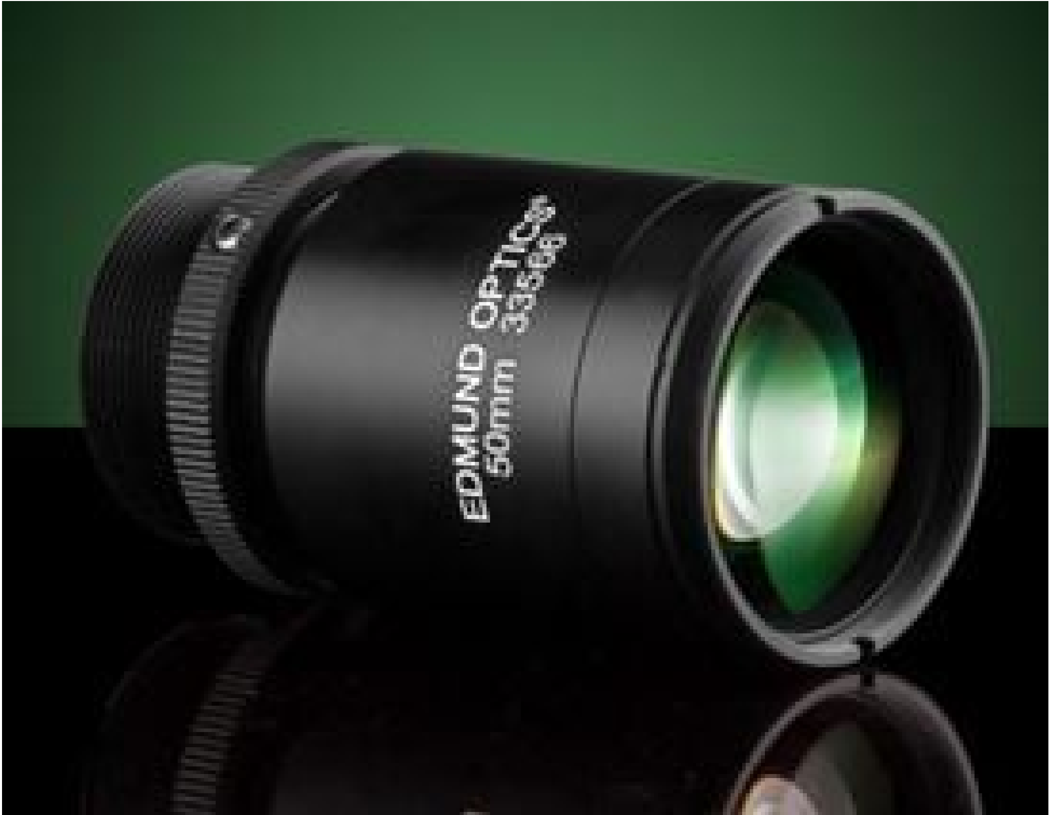
50mm Cx Series Fixed Focal Length Lens, #33-566