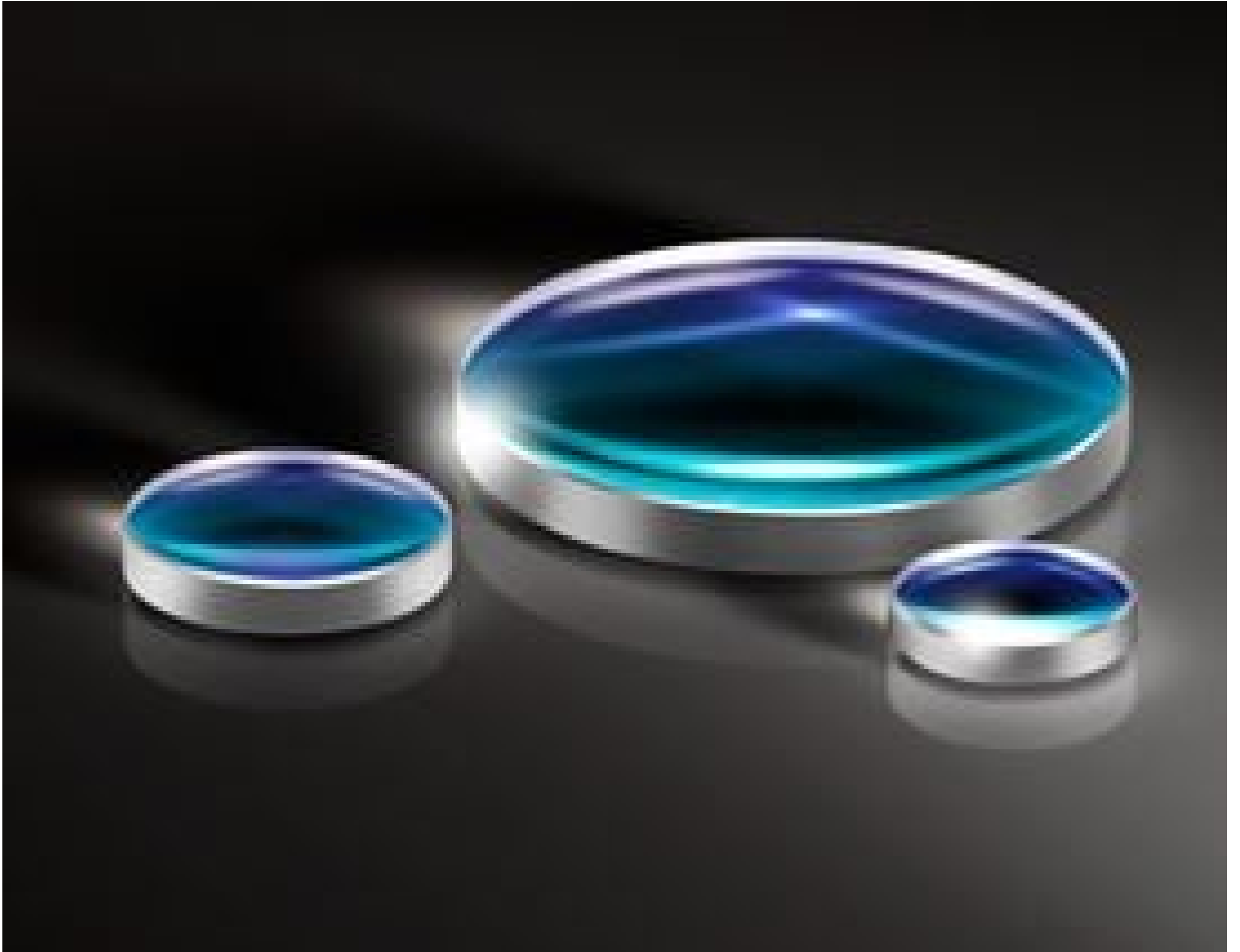
UV Fused Silica Double-Convex (DCX) Lenses