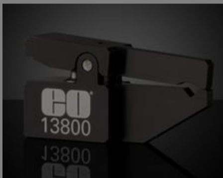
#13-800 - Small Lens Clamp for 4-8mm Dia. Optics €172,00