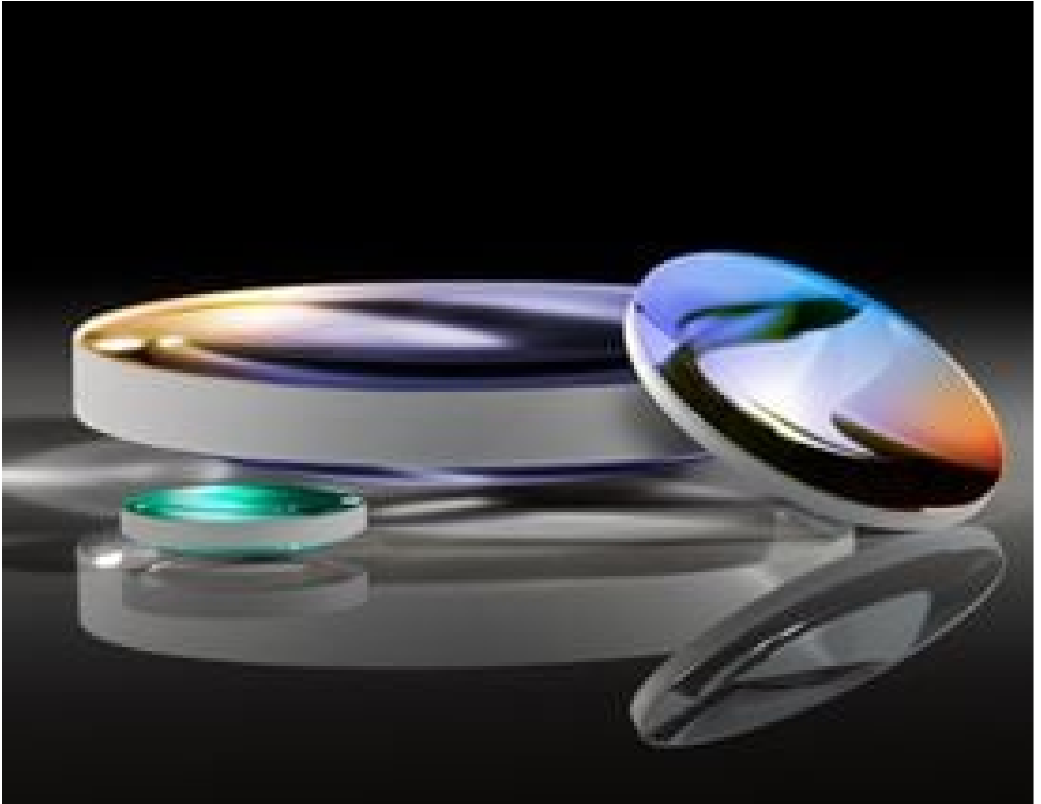
YAG-BBAR Coated Plano-Convex (PCX) Lenses