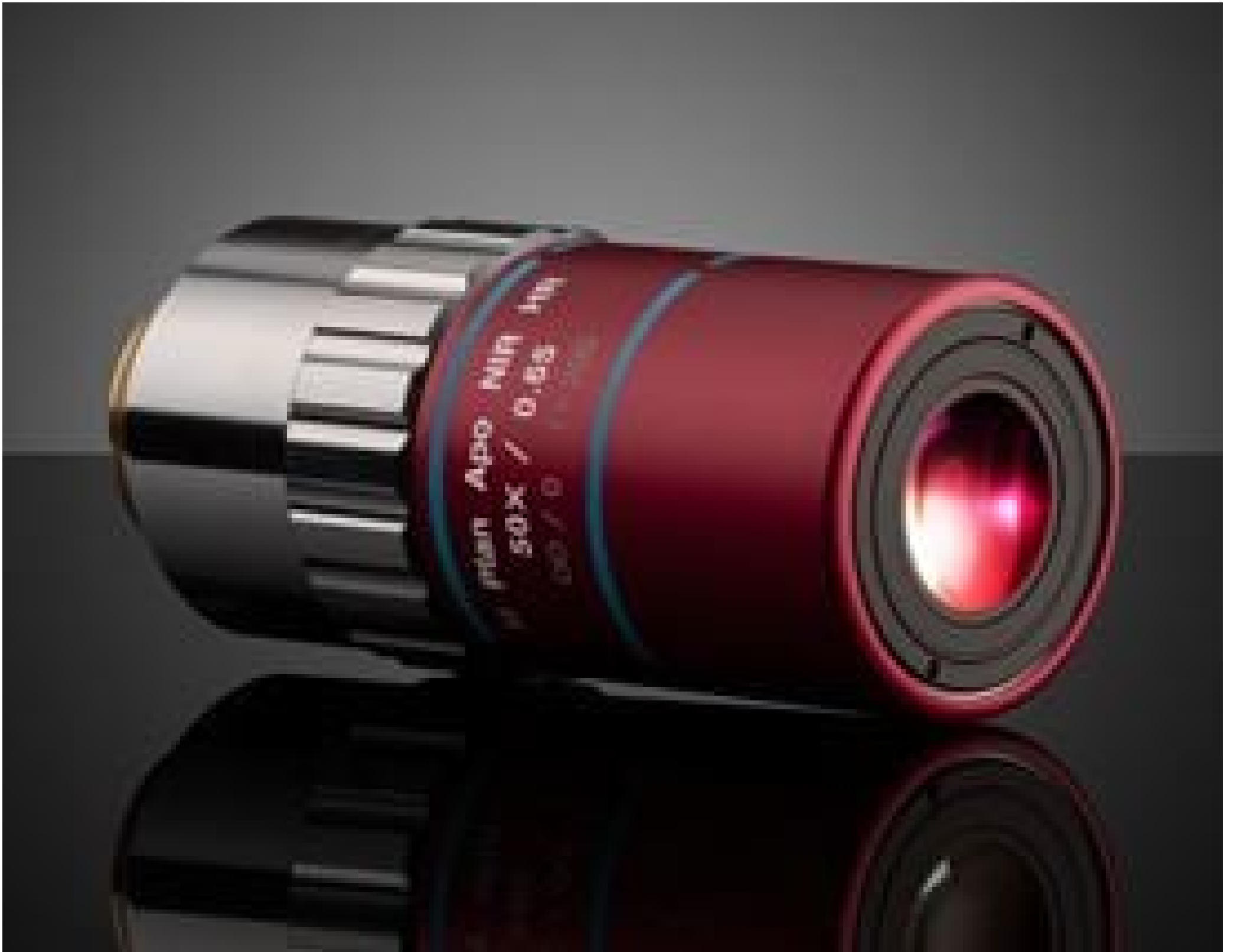
50X Mitutoyo Plan Apo NIR HR Infinity Corrected Objective, #56-982