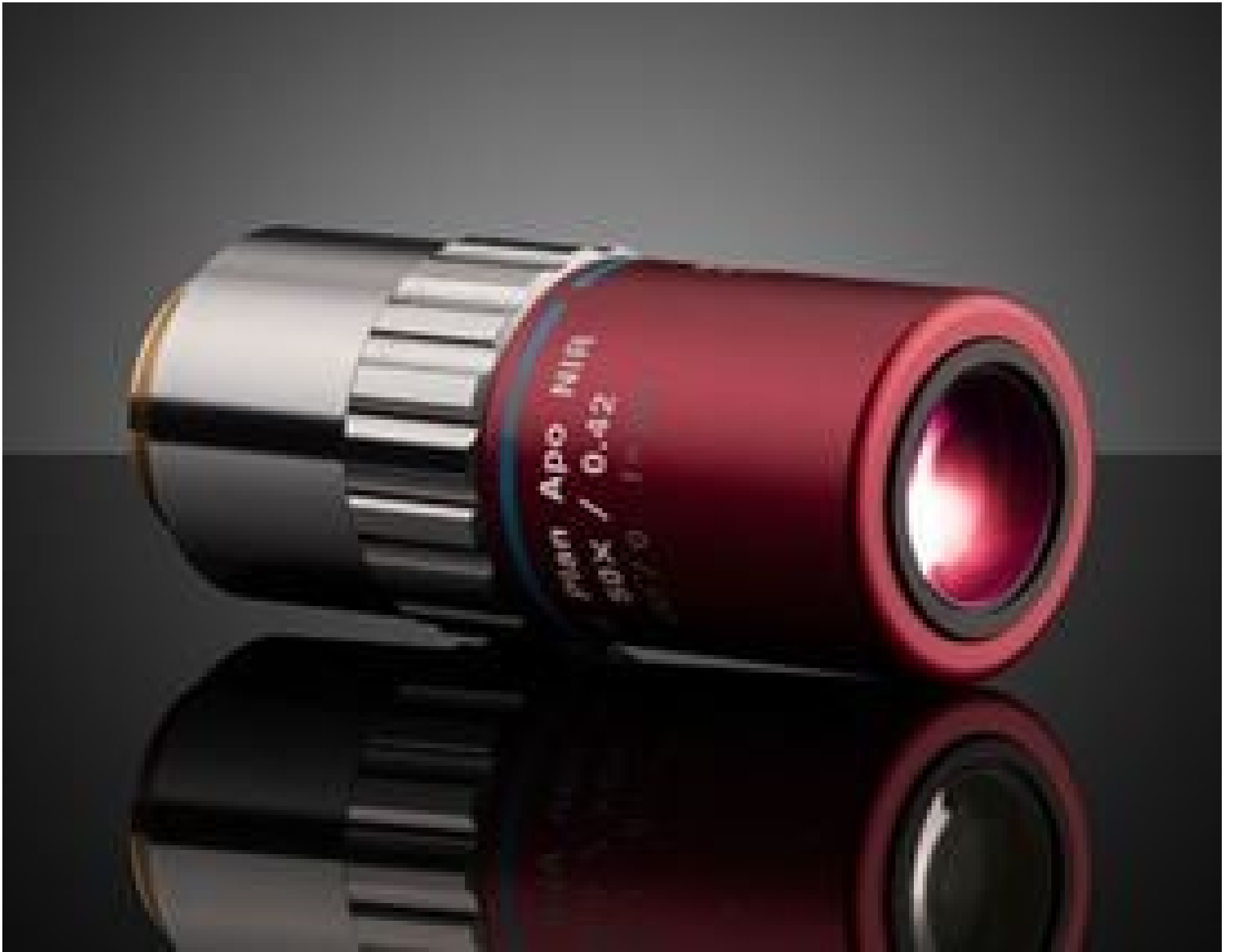
50X Mitutoyo Plan Apo NIR Infinity Corrected Objective, #46-405