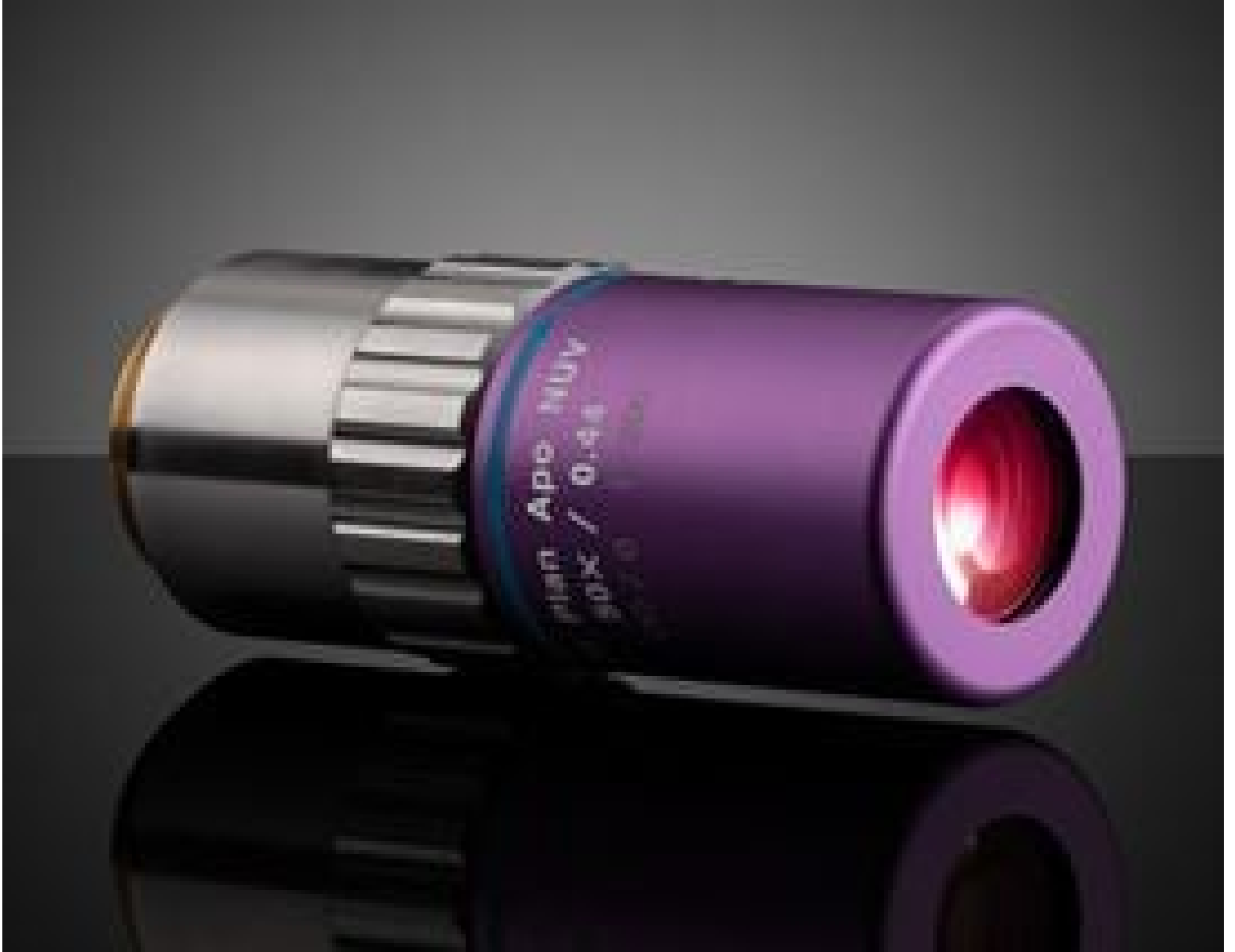
50X Mitutoyo Plan Apo NUV Infinity Corrected Objective, #46-408