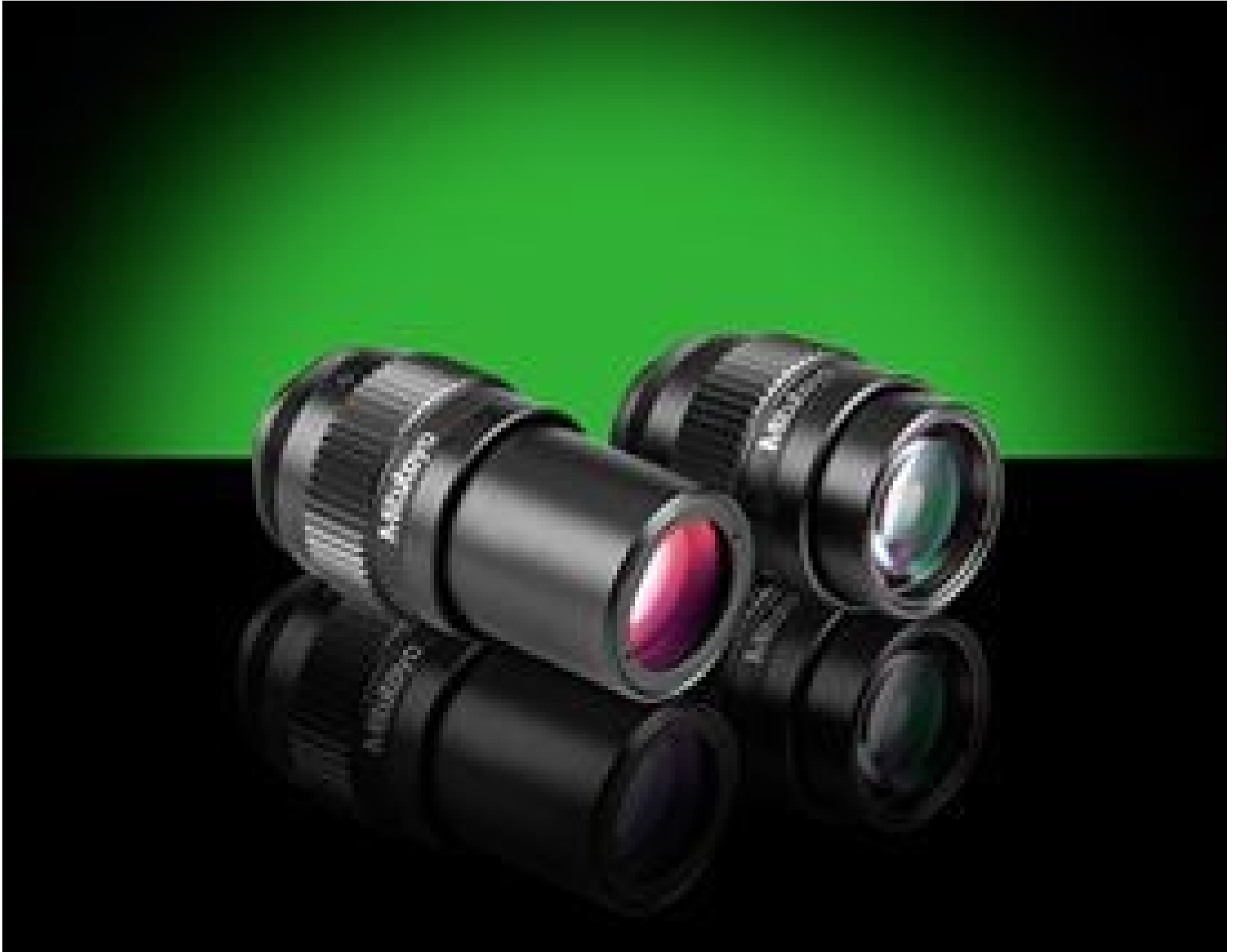
3X (#56-985) & 5X (#56-986)