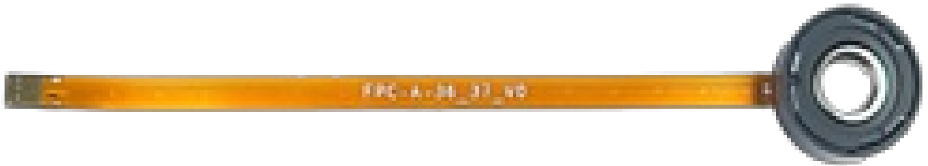
5.8mm CA, A-58Nx-P37 Corning® Varioptic® Variable Focus Liquid Lens