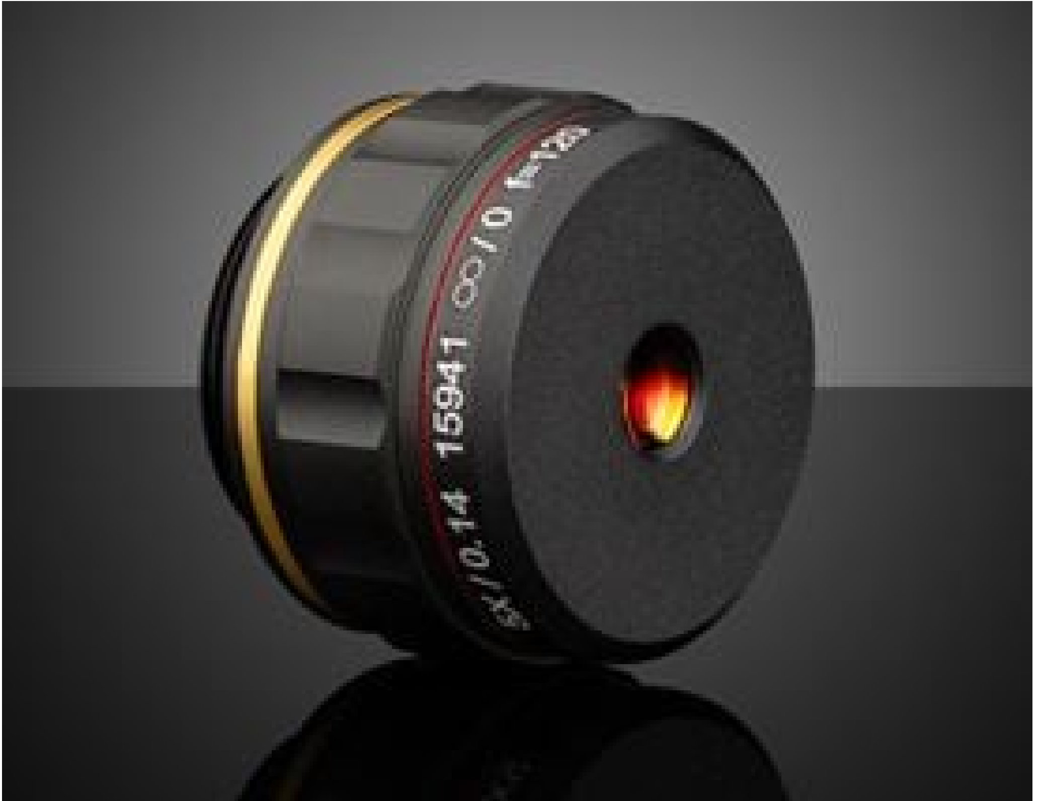
5X 120i Plan APO Infinity Corrected Objectives