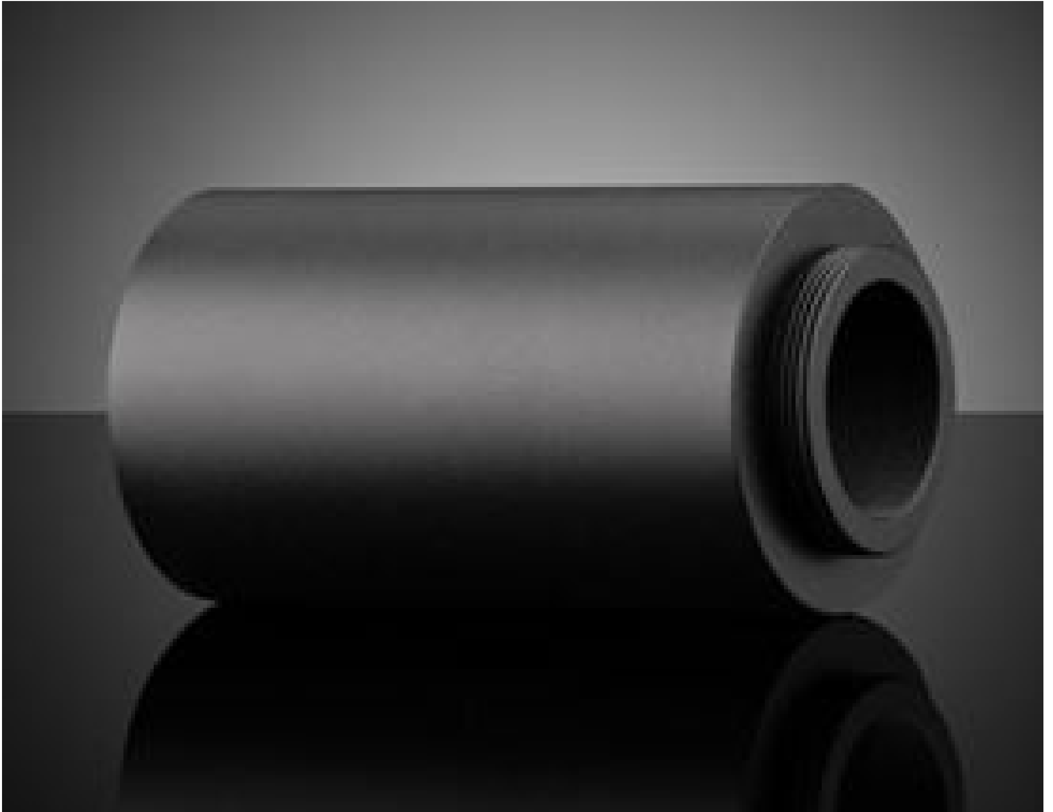
#23-901, 5X, 95mm, C-Mount Parfocal Adapter