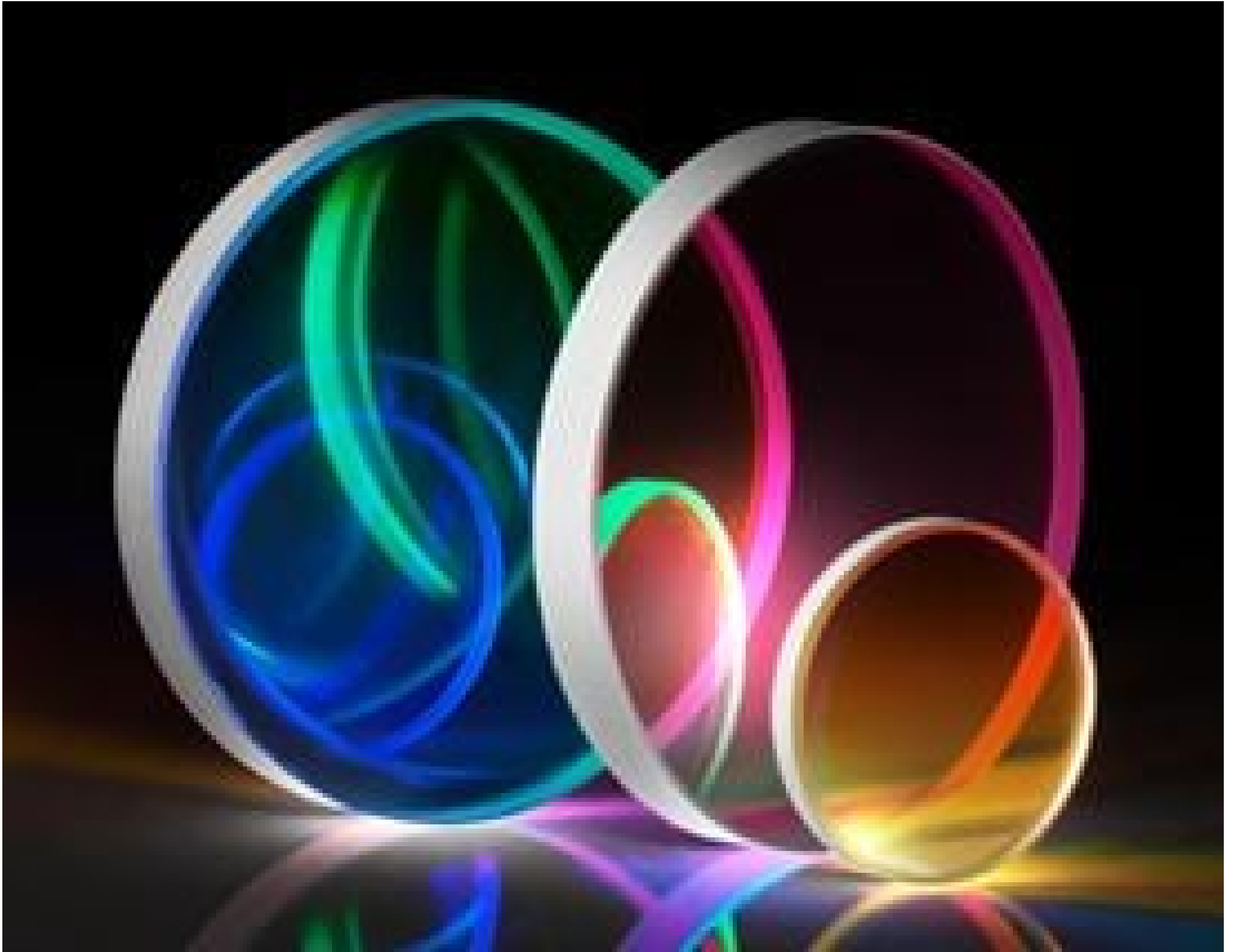
TECHSPEC OD 2.0 Shortpass Filters