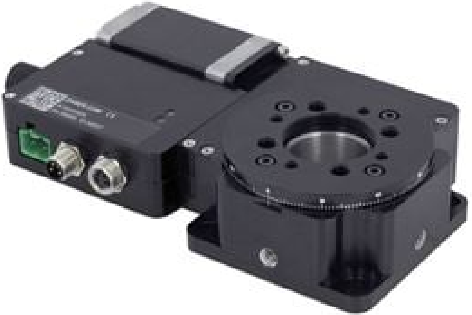
60mm Motorized Rotary Stage, #15-291