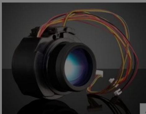
Motorized Telephoto Varifocal Lenses

Please select your shipping country to view the most accurate inventory information, and to determine the correct Edmund Optics sales office for your order.