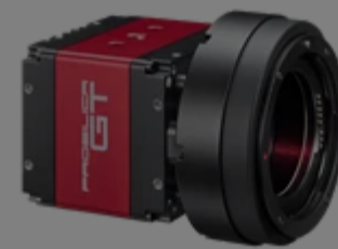
Allied Vision Prosilica GT Series GigE Cameras