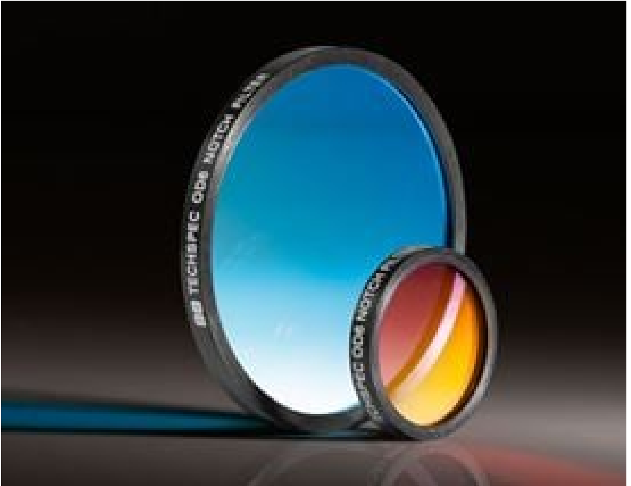
TECHSPEC OD 6.0 Notch Filters