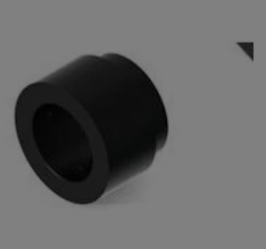
#18-291 - E-Series 19.1mm ID Adapter €24,00